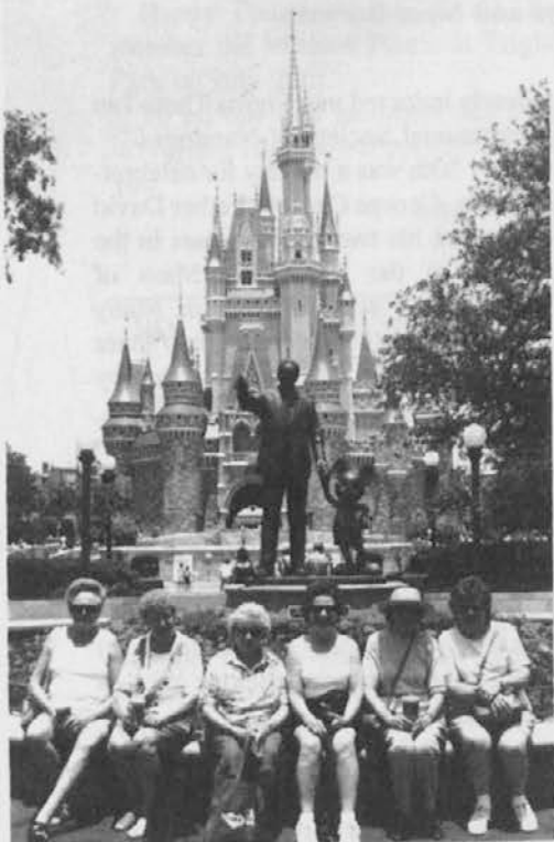
DisneyWorld was the focus for sight-seeing by the Joliet group and Walt Disney seems to be welcoming them to his World.