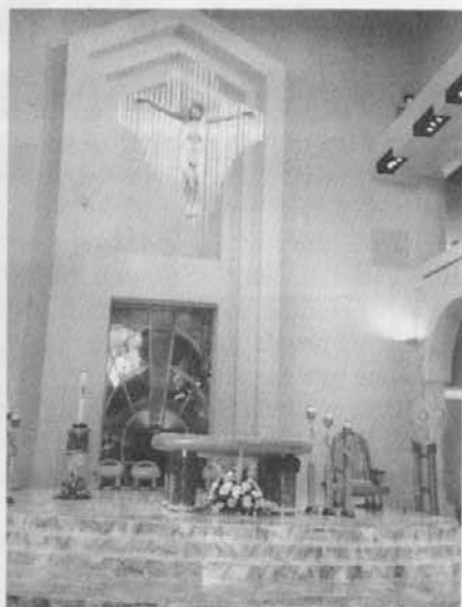
Altar of Mary, Queen of the Universe Shrine in Orlando.