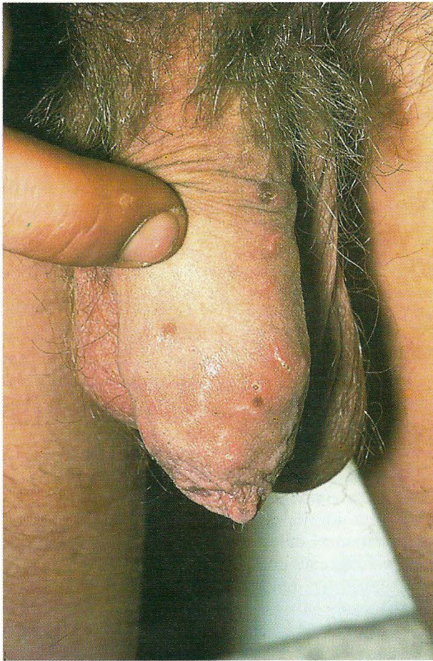
Fig. 2. Typical furrow on the penis shaft.

only a few of them are however epidemically and statistically appropriate. The publication by Konstantinov et al. (5) is highly instructive explaining the origins of the epidemic of scabies in Macedonia during the 1963-74 period. After the disastrous earthquake in Skopje in 1962 the inhabitants were evacuated to rural areas or constraint to live under primitive housing conditions in Skopje. The authors are indicating that in the years preceding the earthquake, endemic foci of scabies existed in remote villages where the evacuated inhabitants got infected. Konstantinov et al concluded that the number of evacuees got infected and started to spread the infection upon their return to Skopje. The fact that a too long period of time elapsed before dermatologists and general practitioners be came aware of scabies was also important.