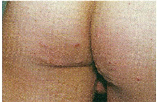
Fig. 3. Papular probably already granulomatous lesions on the buttocks.

The incidence of scabies in Slovenia is characterized by a major peak in 1972 and a minor one in 1981 and 82. As it can be detected from fig. 1 scabies is