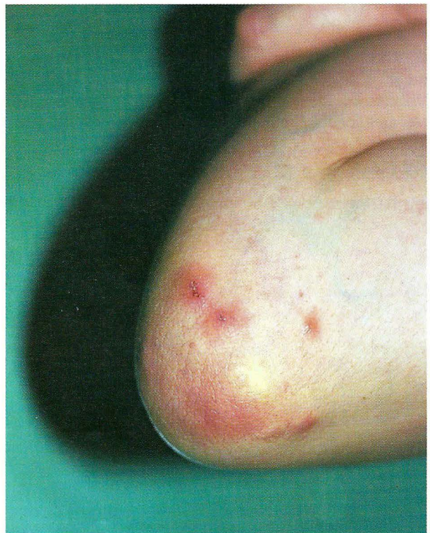
Fig. 4. Papular lesions on the elbow.

continuously present in the Slovenian population since the outbreak of the epidemic but is definitely on decline. The persistence of scabies lasting for almost 20 years is still not completely explained. It is assumed that the primary cause were the guest-workers from the under-developed parts of former Yugoslavia who used to come to Slovenia in elevated numbers during the late sixties and early seventies. Many of them were successfully treated for scabies