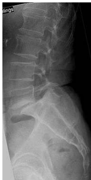
Figure 2. Spondylolisthesis. (Note the misalignment of the fifth lumbar vertebrae above the sacrum, which is the result of slipping forward of the fifth lumbar vertebrae).

In the study on olympic-level female gymnasts spondylolysis and spondylolisthesis were found in 3 out of 19 gymnasts, and were present only in the subgroup with the current ongoing low back pain (Bennet et al., 2006). Similarly to the above mentioned results of Goldstein et al. (1991), the abnormalities of the spine in the study of Bennet et al. (2006) were detected in approximately two thirds of olympic-level gymnasts. In the contrast to this two reports, in the study on elite horse vaulters only slight degenerative changes of the lumbar spine were found with MRI scanning, although 85% of included vaulters reported back pain and 75% reported daily back pain (Kraft et al., 2007). Therefore it may be concluded from this opposite findings that the presence of back pain