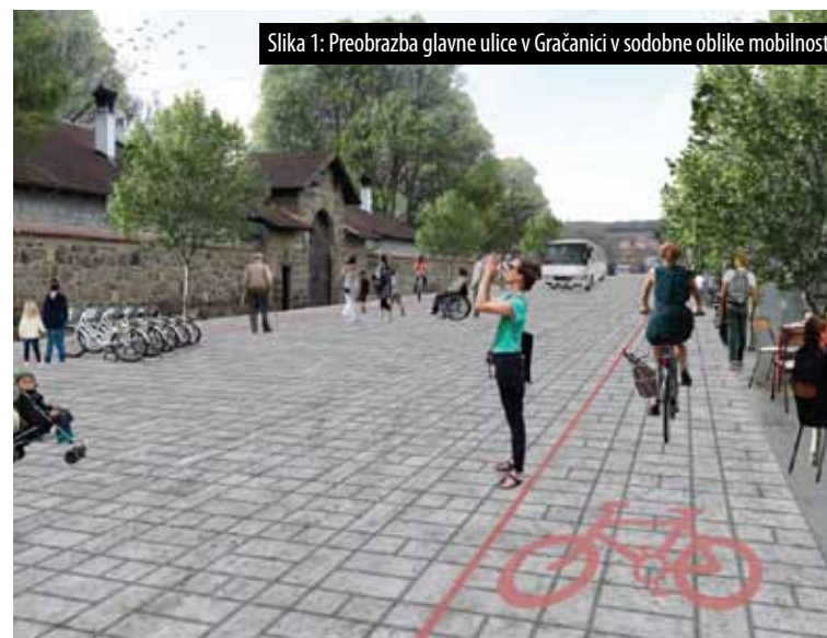
Slika 1: Preobrazba glavne ulice v Gračanici v sodobne oblike mobilnosti.