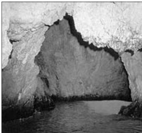
Fig. 5: Partly submerged cave Modra spilja (Blue Cave) on Biševo Island.

of immediate submerging of the speleothem by the rising sea, dating of speleothems from vertical objects on steep terrains also provided acceptable results. Namely, on steep terrains (present sea bottom), the bedrock between the rising sea and the pit was not so thick as to prevent sufficient sea water intrusion and establishment of the marine environment inside the objects, such as on the flatten terrains. In the Cave in Tihovac Bay (Pag Island), marine conditions with colonies of organisms belonging to characteristic biocenosis of completely dark caves and passages, at the depth of 23 m, were probably established 8300 years ago when the distance between the cave and open sea was approximately 160 m. In the Pit in Lučice Bay (Brač Island), at depths of 36 and 34 m such conditions were established c. 10500 and 9100 y BP respectively, when the open sea was less than 170 m far from the pit (Surić 2002).