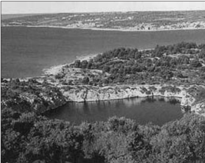
Fig. 4: Marine lake Zmajevo oko (Dragon's eye) near Rogoznica.

Even more interesting is the hydrological system near Trogir which consists of submarine springs Arbanija and Slatina in Bay of Kaštela at the depth of 32 and 35 (39) m respectively, the permanent brackish spring Pantan at 2,7 m a.s.l. cca 400 m far from the sea and intermittent brackish spring Slanac (meaning "salty") at 30 m a.s.l. During the lower, Late Pleistocene-Holocene sea level stands, hinterland water had been discharging through the coastal springs which, after the sea level rise, became submarine springs in the Bay of Kaštela. Simultaneous groundwater rise resulted in the appearance of coastal spring Pantan on higher elevation and decreasing runoff through vruljas. They became just occasionally active throughout the rainy periods due to increased pressure in the hinterland. During the summer, decreasing pressure induces reversible process with landward sinking of salt water into the previous vruljas, acting now as marine estavelles, and directing sea water through passages devel-