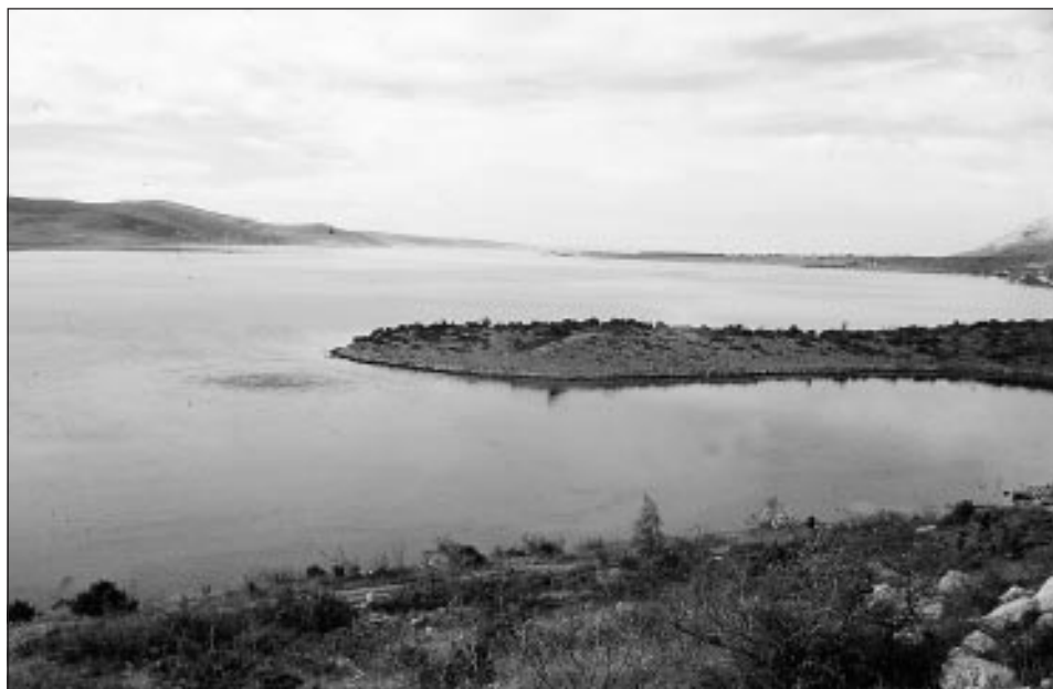
Fig. 2: Submarine spring Vrulja Zečica near Starigrad (Photo by D. Petricioli).

Corrosional processes of karstification undoubtedly cease by the sea water flooding, but the erosion can go on even under the sea, precisely through the major channels of the submarine springs with abundant discharge. An example is vrulja Zečica under Mt Velebit (Fig. 2) in which pebbles and cobbles originating from Mt Velebit can be found (Bakran-Petricioli & Petricioli, 1999).