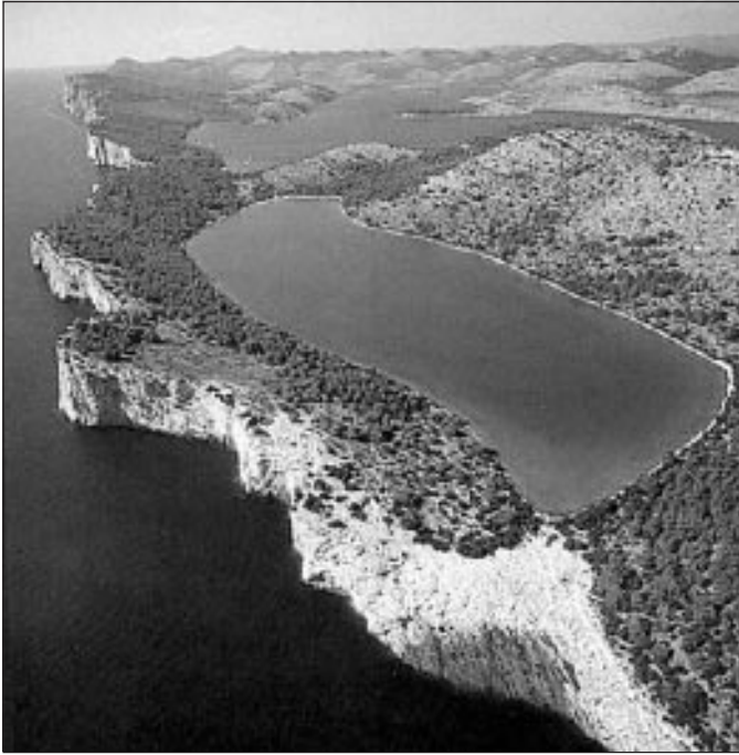
Fig. 3: Marine lake Mir (Dugi otok Island) with steep tectonical coast - fault plane of Dugi otok fault.