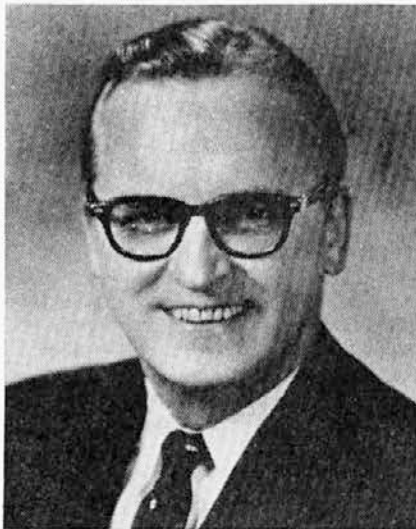
Hon. John A. Blatnik, M. C. of Minnesota

A senior Congressman in the U. S. House of Representatives is the Honorable John A. Blatnik, beloved "favorite son" of our Minnesotans on the Iron Range.