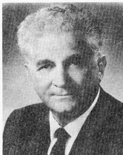
The Honorable Frank J. Lausche United States Senator from Ohio

One of the ablest and most respected statesmen in the United States government is our countryman, Frank J. Lausche, whose career in the highest public offices spans nearly half a century.