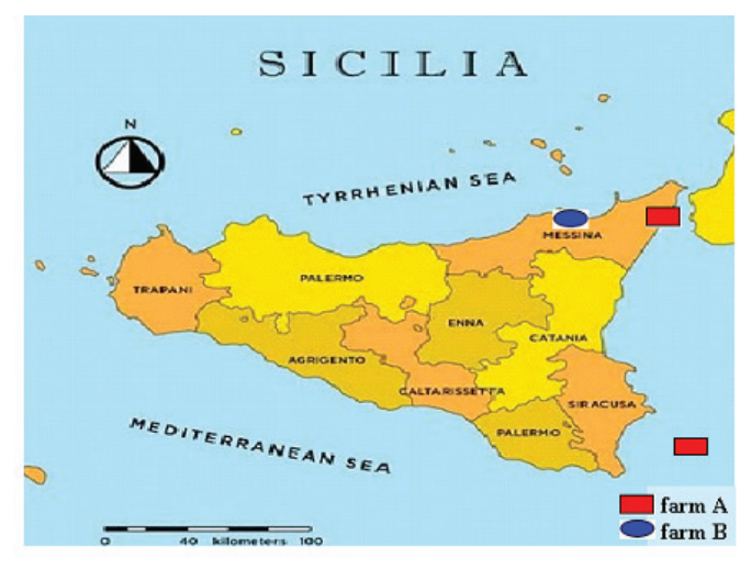
Figure 1: Map of Sicily

Non endemic goitre area = farm A Endemic goitre area = farm B