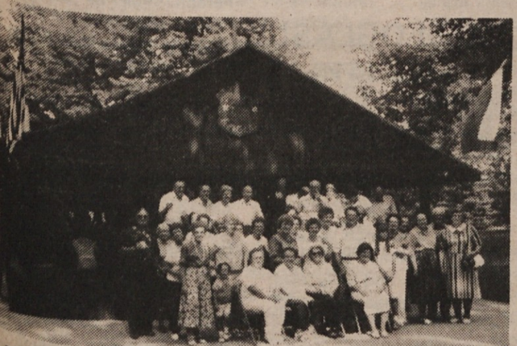
Med obiskom v Triglavskem parku v Milwaukeeju so se pristavski upokojenci zbrali pred čednim domom v sicer vedno zelo lepo urejenem parku.