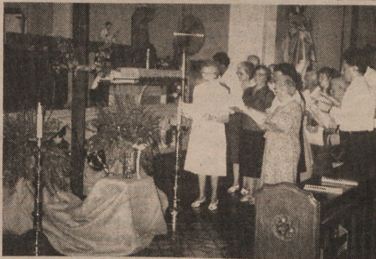
Cerkveni zbor sv. Vida poje ob žalni komemoraciji 27. junija.