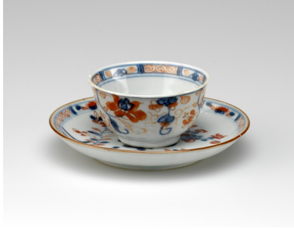
Figure 2. Porcelain dish from Viktor Smole's collection.

elaborate Chinese bowl with a cover; a cylindrical Chinese tureen; a Japanese and a Chinese porcelain plate in bright colours with gold ground, both of which had been donated by Count Franz von Hohenwart; a Chinese cup with animal motifs from the Countess von Hohenwart; ten smaller Japanese cups (used for drinking coffee) from the Viktor Smole collection (fig. 2); and a Japanese coffee cup that had once belonged to the Baroness von Lazzarini (Deschmann 1888, 159–67).