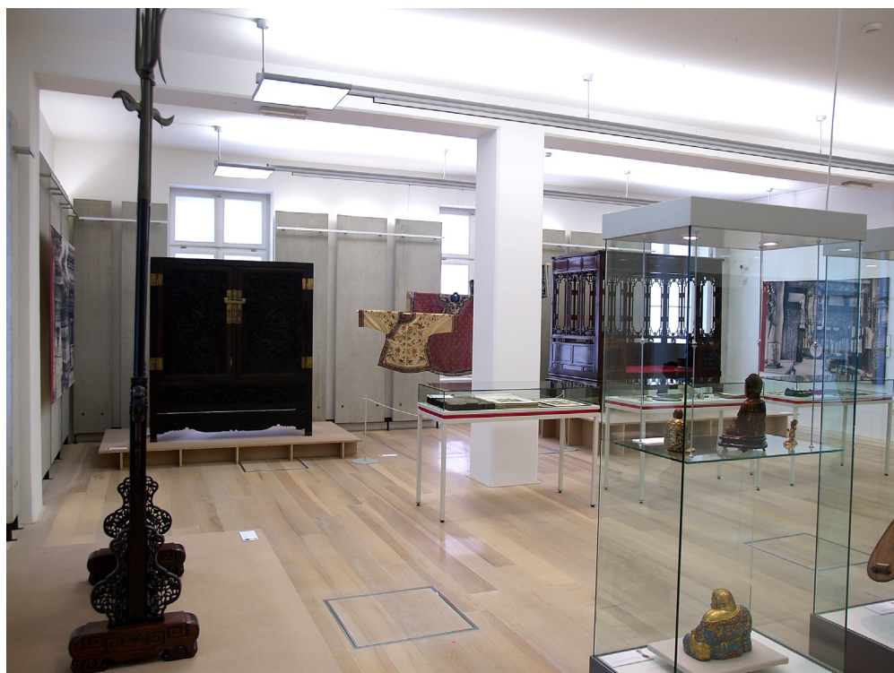
Figure 7. The exhibition Encounters with China: Traces of Chinese Cultural Heritage in Slovenia at the Slovene Ethnographic Museum in 2006.

in Ljubljana in 2006 (fig. 8). As noted by Zmago Šmitek (2007, 275), the exhibition did not limit itself to the past but also raised questions that were relevant to contemporary China. A further development in the reinterpretation of Chinese objects and their artistic value was stimulated by the accompanying exhibition of contemporary art mounted by six graduates of the School of Drawing and Painting (in the Academy of Fine Arts and Design) under the leadership of the Chinese–Slovenian artist Wang Huiqin. In addition to the Chinese objects presented in the main exhibition, the accompanying smaller one explored the interplay of Slovenian contemporary art and Chinese visual production.