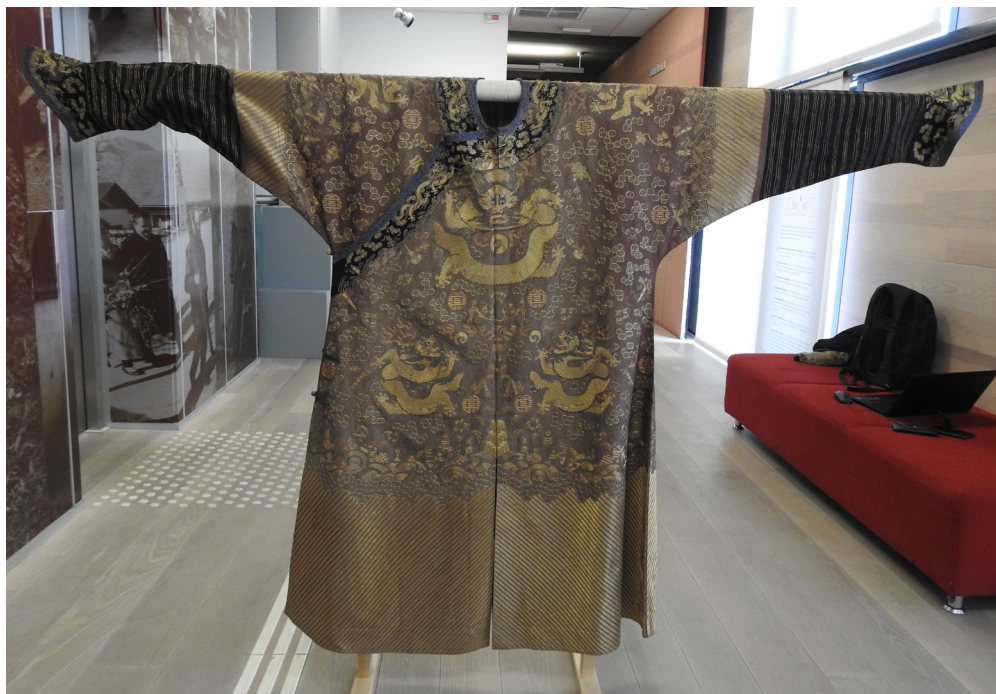
Figure 4. Chinese robe with dragons with five claws.

When restoration work began on the Goričane mansion in 1990, Chinese and other non-European collections were moved to the depository, which meant that exhibitions and research activities based on the East Asian collections had largely to be interrupted. Further degradation of the collections followed after the closing of the Museum of Non-European Cultures in 2001, which coincided with the denationalization of the Goričane mansion. The collections have since then been transferred to the new premises of the Ethnographic Museum on Metelkova Street in Ljubljana (Čeplak Mencin 2012, 117), where they still more or less lie dormant in a depository. There was a short-term revival of interest in the objects in 2006 thanks to the organization of the 16th biennial conference of the European Association for Chinese Studies in the Slovenian capital and, in particular, the initiative of Professor Mitja Saje from the Department of Asian Studies at the University of Ljubljana to stage a larger exhibition that would present cultural contacts between Slovenia and China to international sinologist colleagues. Ralf Čeplak Mencin, the curator of the exhibition, followed the conceptual design of “classical” ethnological collections, focusing on the stories of the collectors, but he also selected objects from as many as twelve different