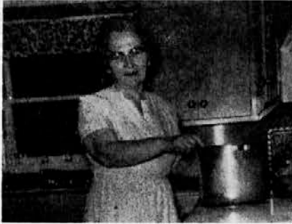
Branch 45, Portland, Ore.