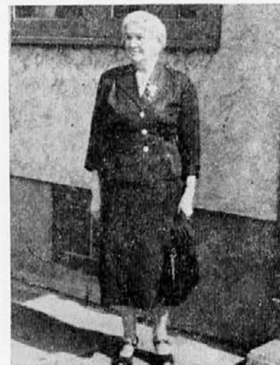
Branch 56, Hibbing, Minn.