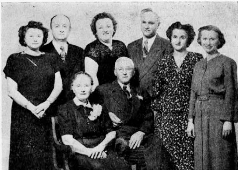
Podružnica št. 19, Eveleth, Minn.