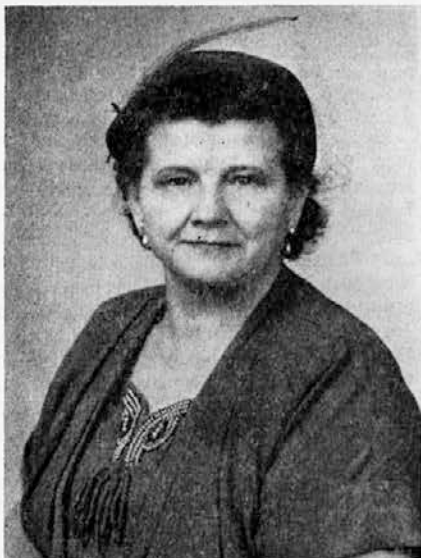
Podružnica št. 47, Euclid, Ohio.