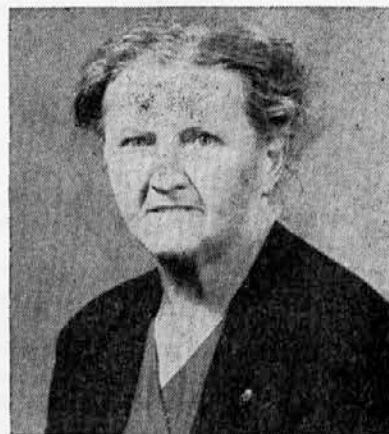
Branch 12, Milwaukee, Wis.