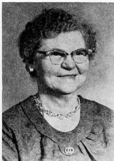
Branch 66, Canon City, Colo.

There's just one thought within me, The thought, dear Mother, of you, And until we meet again, My thoughts of love to you I send. Though you may be far away, I think of you each hour, each day, Through the years my prayers shall be, That God will keep you safe for me.