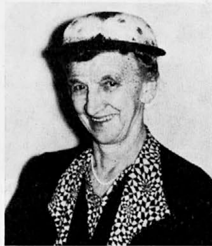
Podružnica št. 96, Universal, Pa.

Sestra Kirn je pri podružnici vedno aktivna kar se da in vedno pripravljena pomagati, tudi redko zamudi mesečne seje.