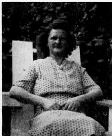
Podružnica št. 77, N.S. Pittsburgh, Pa.