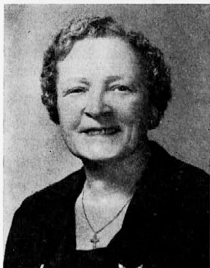
Podružnica št. 10, Cleveland, Ohio.