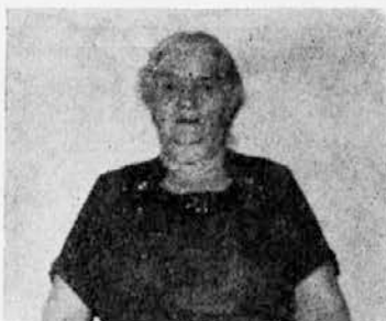
Branch 26, Pittsburgh, Pa.