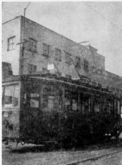
Ljubljanski tramvaj — zdaj v muzeju.

Maslo vmešaj z rumenjaki, pretlači sir skozi cedilo ter ga prideni maslu in rumenjaku, dodeni par žlic smetane in nazadnje še sneg iz beljakov. S tem nadevom namaži testo potem, ko si ga razvaljala in raztegnila. Štrukelj zvij, ga položi v moker in z drobtinami potrošen prtiček, narahlo poveži z vrstico ter ga v slanem kropu kuhaj ¾ ure. Kuhanega odvij, zreži na kose in zabeli z na maslu ocvrtimi drobtinami. Te vrste štrukelj lahko tudi pečeš. Takrat nadev osladkaj, ga potrosi z rozinami ali naribanimi jabolki.