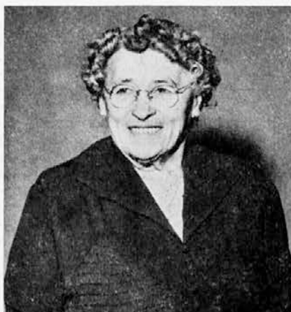
Podružnica št. 33, Duluth, Minn.