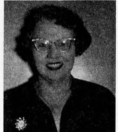
Branch 55, Girard, Ohio.