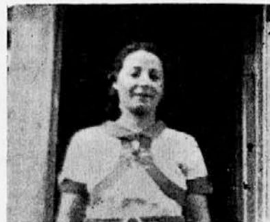
Branch 92, Crested Butte, Colo.