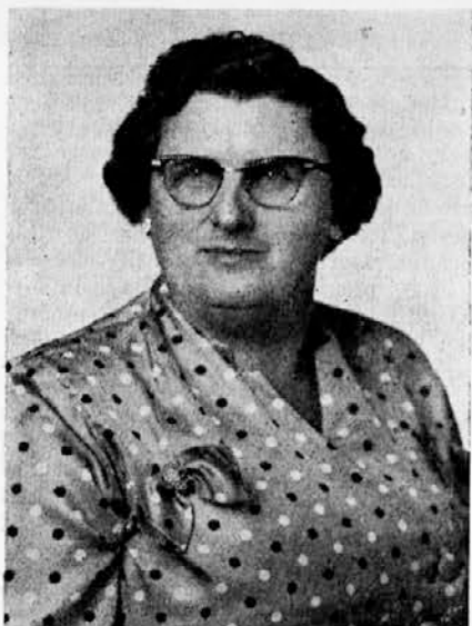
Branch 23, Ely, Minn.