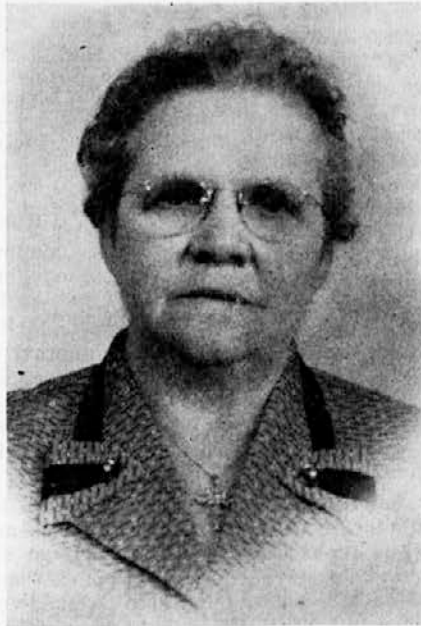
Podružnica št. 2, Chicago, Ill.