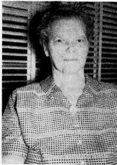
Branch 54, Warren, Ohio.

When time allows, she enjoys crocheting.