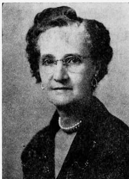
Branch 3, Pueblo, Colo.

To our chosen S.W.U. "Mothers of the Year"—this issue is dedicated.