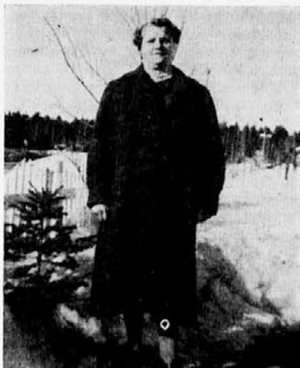
Branch 34, Soudan, Minn.