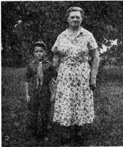
Podružnica št. 1, Sheboygan, Wis.