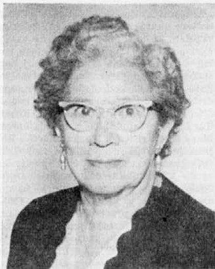
Podružnica št. 49, Noble, Ohio.