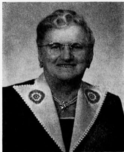
Podružnica št. 17, West Allis, Wis.