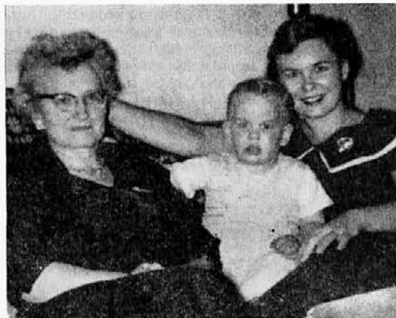
Branch 50, Cleveland, Ohio.