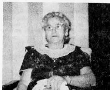
Podružnica št. 41, Cleveland, Ohio.