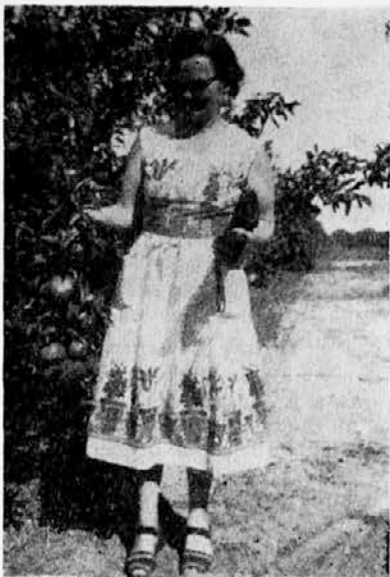
Branch 73, Warrensville Hgts., Ohio.

make life a little more enjoyable. But, she has 13 more joys, and that's her grandchildren (and there'll be one more to love by the time this Zarja is read).