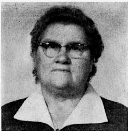
Podružnica št. 14, Euclid, Ohio.

Dete, zatiski premile oči, materin ljubček, le kmalu zaspi. Sanje naj sladke zazibajo te, zlate peroti naj približajo se. Slušaj, kaj angeljci tebi pojo: Spavaj, oj dete, le spavaj sladko!