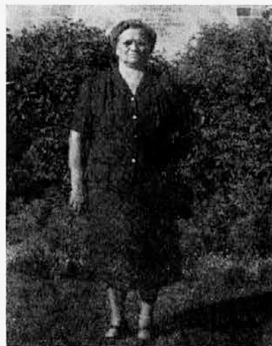
Podružnica št. 15, Cleveland, Ohio.