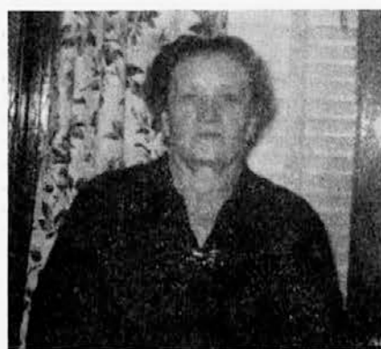
Podružnica št. 40, Lorain, Ohio.