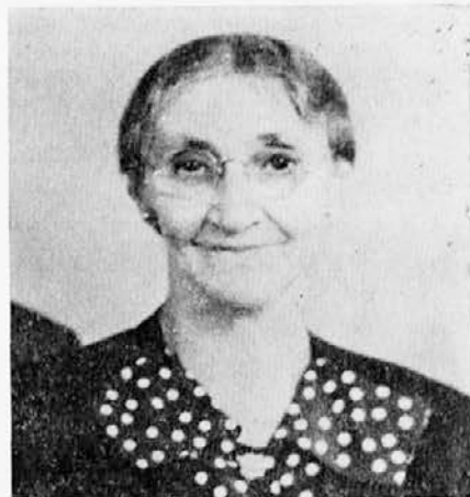
Branch 52, Kitzville, Minn.

"Yes, life is still worth living", she maintains, "as long as we remember to pray as though we will die tomorrow and work as though we will live forever!"