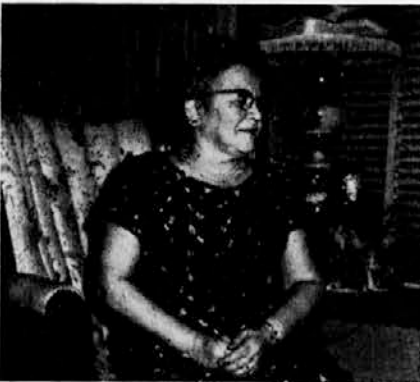
Branch 46, St. Louis, Mo.