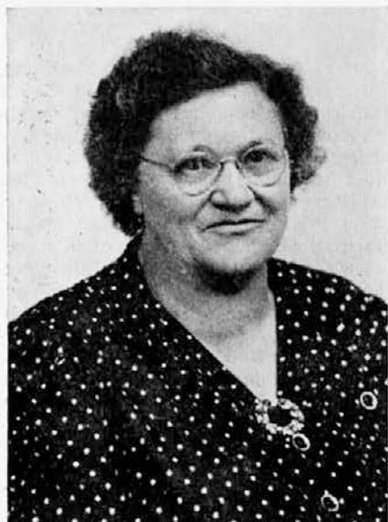
Podružnica 32, Euclid, Ohio.