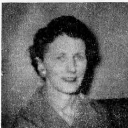
Branch 57, Niles, Ohio.