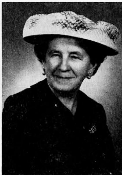
Podružnica št. 89, Oglesby, Ill.