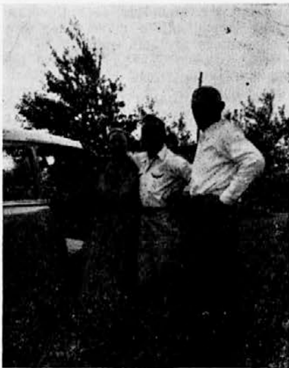
Branch 83, Crosby, Minn.

Enumclaw branch, has been vice-president for 22 years and last year was named president. She and her husband are active and beloved members of the A.F.U. and K.S.K.J. organizations in their locality as well as in church and community affairs. No Slovenian gathering is complete without her good humor and companionship. She is pictured with the four generations of her family. Congratulations!