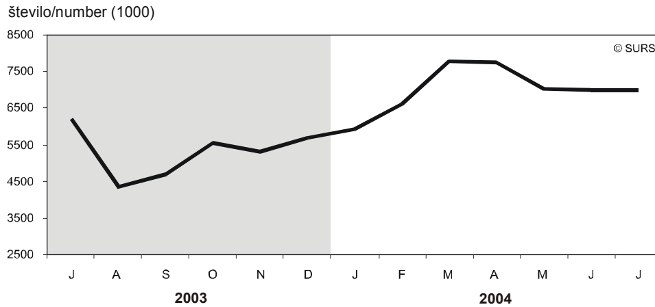
Chart 2: Passenger cars, registered for the first time, Slovenia, July 2003 - July 2004