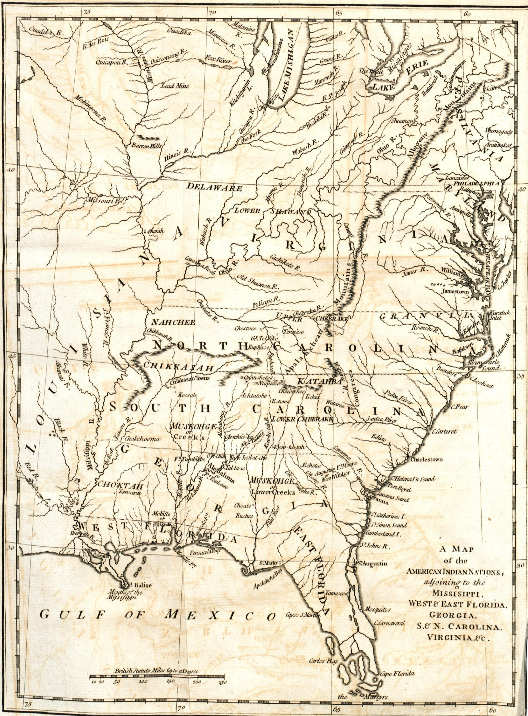
A MAP of the AMERICAN INDIAN NATIONS, adjoining to the MISSISSIPPI, WEST & EAST FLORIDA, GEORGIA, S. & N. CAROLINA, VIRGINIA, &c.

British Statute Miles 69 to a Degree 10 20 50 100 150 200 250