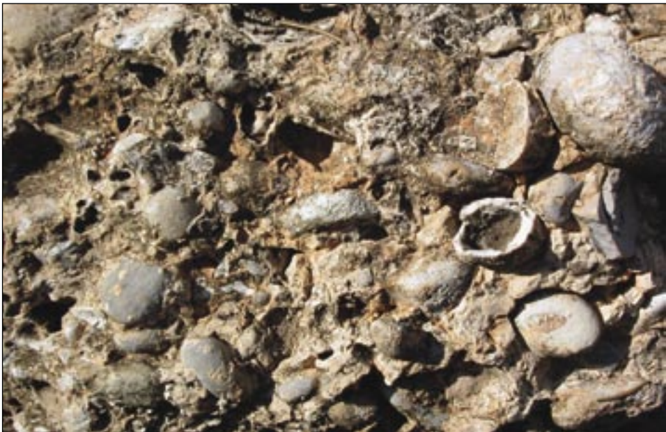
Fig. 3: Detail of the conglomerate including empty pebbles.