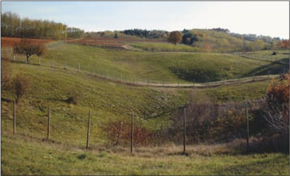
Fig. 5: Dolines of the V terrace. Terra rossa soils are evidenced by agricultural works.