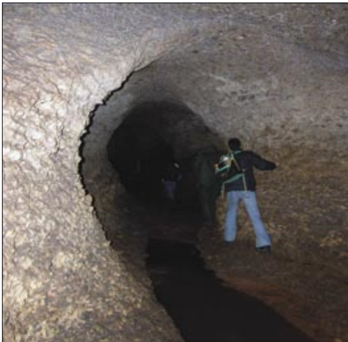
Fig. 6: A cave gallery developed in the conglomerate in phreatic conditions.