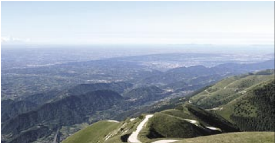
Fig. 1: The Montello as seen from the Prealps (dark elongated ridge in the background) is like the back of a whale emerging from the high Venetian Plain.

It is possible to recognize in it a complex system of fluvial planation and incision forms distinguishable as: