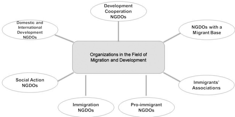
Figure 1: Map of Organizations in the Field of Migration and Development.

The map of organizations in the field of migration and development has, then, become more complex, as shown in Figure 1. This growing organizational complexity ought to be reflected in a reclassification of the categories hitherto used. The considerable extant diversity should be reflected by taking account of each organization’s makeup (NGDOs with a domestic base, composite NGDOs and NGDOs with a migrant base) and purpose (NGDOs oriented toward international development cooperation, NGDOs oriented toward domestic social action, domestic and international development NGOs and pro-immigrant NGOs focusing on defending immigrants’ rights) and differentiating between what we call “immigration NGOs” (which impact the field of migration but do not come from the migration field), “migrant NGOs” (which have evolved from immigrants’ associations, also termed “NGDOs with a migrant-led base”) and immigrants’ associations that remain unchanged.