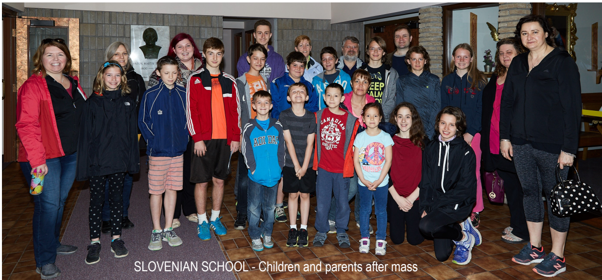
SLOVENIAN SCHOOL - Children and parents after mass