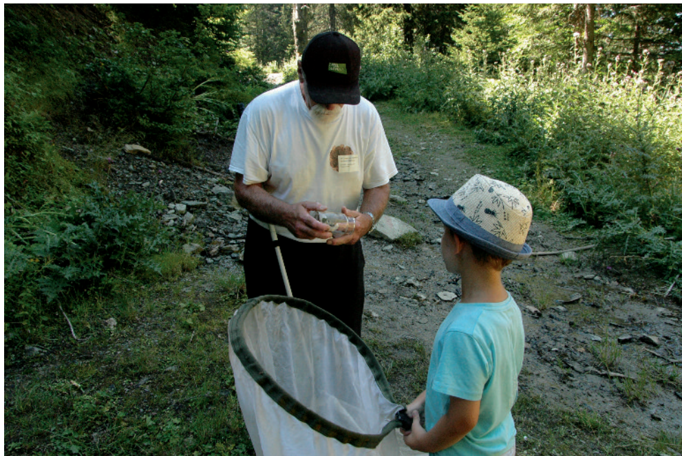
Fig. 1. Collecting with entomological net

For a few species, genitalia were checked ( Leptidea sinapis/juvernica , Hipparchia semele/volgensis , Melitaea athalia/aurelia , etc.). We still have ambiguous literature