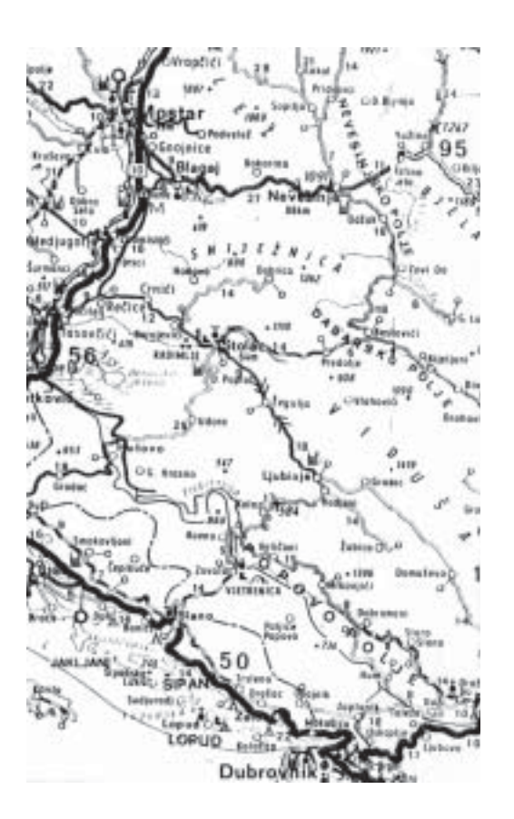
The map of investigated area