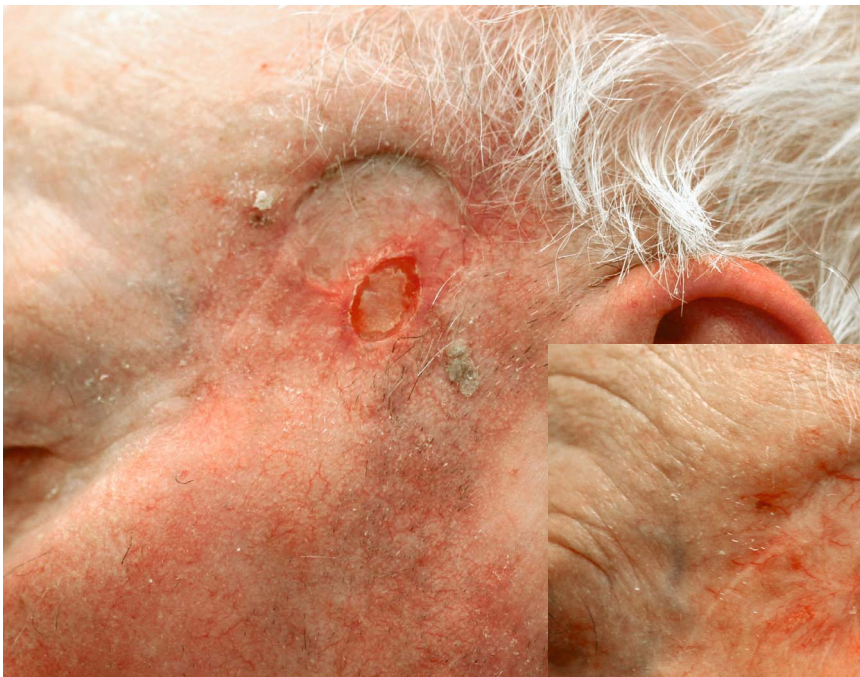
Figure 1. Local recurrence of the acrospiroma.

The fine needle biopsy performed in April 2007 confirmed local recurrence of the disease (Figure 1).