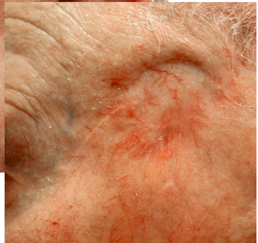
Figure 2. The tumour completely regressed after radiotherapy.