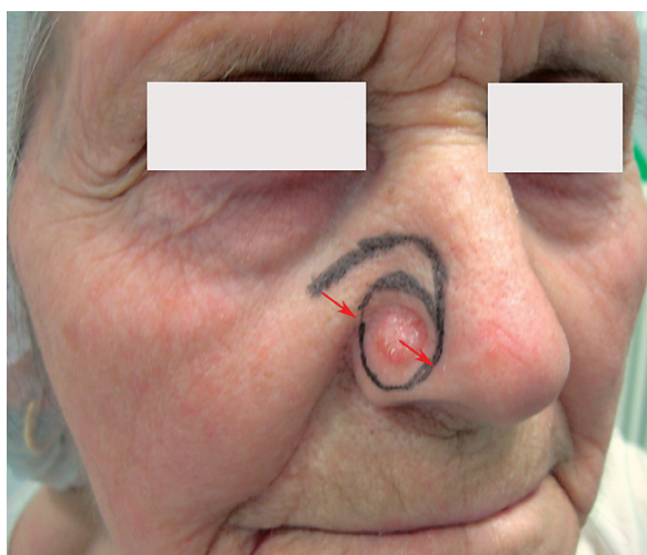
Figure 2. Lesion to be removed in a circle, with larger borders of healthy skin.

The "skin helix" flap with an elliptical flap widens from the lesion border to attain the width of the lesion radius (see red arrows).