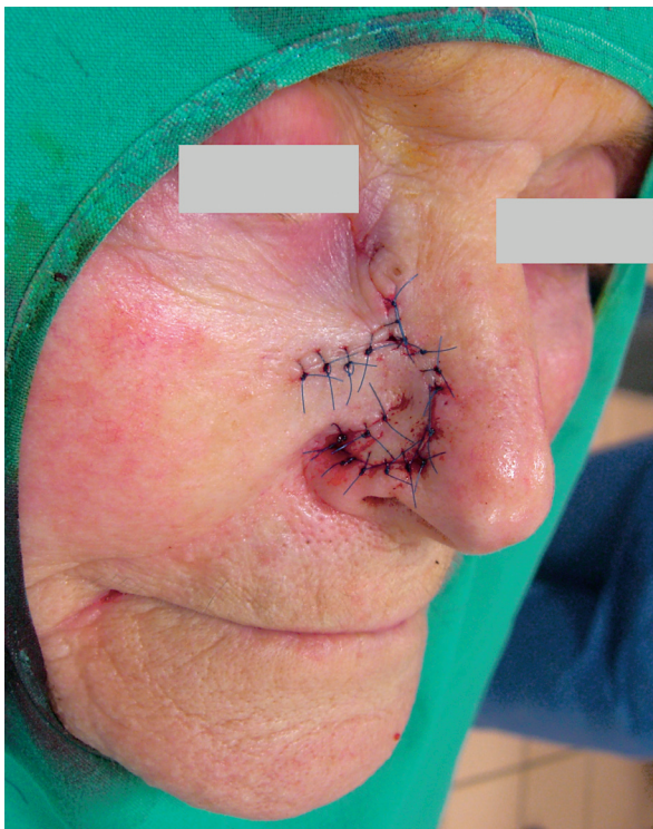
Figure 4. The "skin helix" flap in its final position already sutured; note the small discharge triangle already sutured on the right corner of the nose.

all the different cutaneous layers with its distal portion that perfectly reconstructed the stretched convexity of the nasal ala and with part of the sutures naturally covered by the naso-labial furrow.