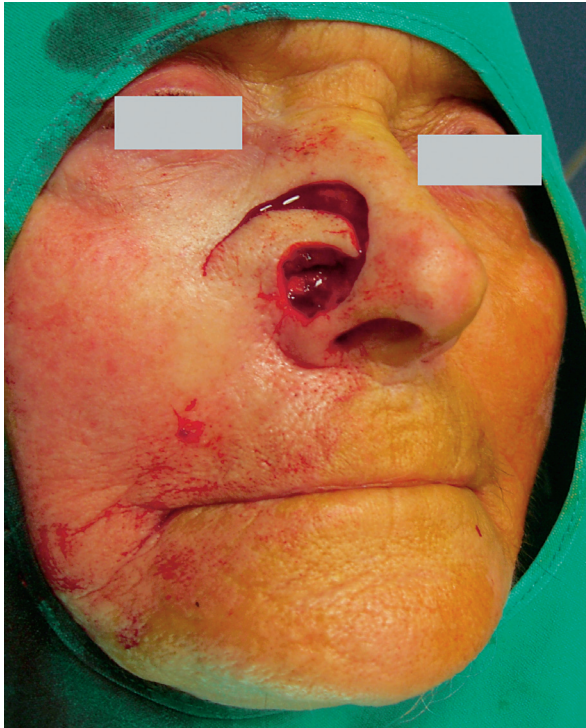
Figure 3. The "skin helix" flap already mobilized and ready for advancement, rotation, and tailspin to repair the circular defect.