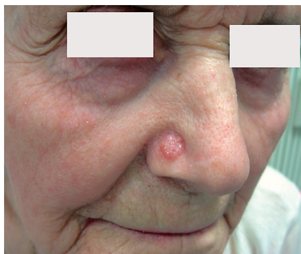
Figure 1. Nodular basal cell carcinoma localized on the nasal ala.

In our clinical case the "skin helix" flap represented a good option inasmuch as it allowed us to not turn a circular lesion into a size 4 lesion, giving us better outcomes than those we could have obtained with a skin graft. It also allowed us to respect the direction of