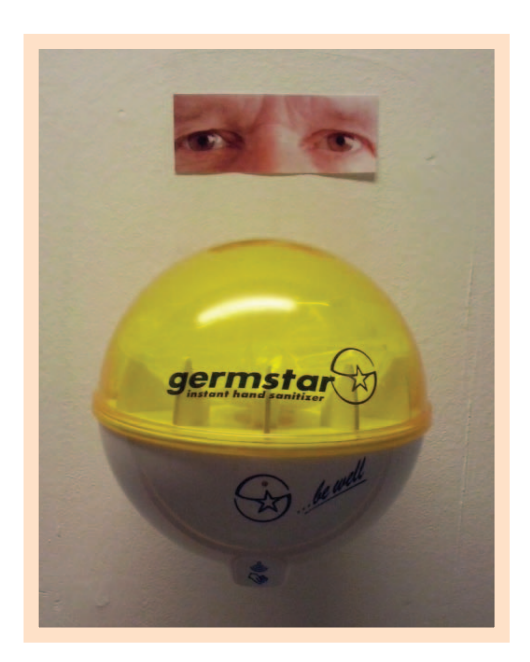
Figure 3: Picture of male eyes above automatic alcohol dispenser