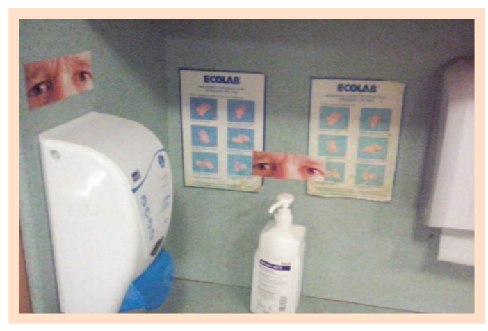
Figure 4: Picture of male eyes next to the alcohol dispenser and the soap dispenser