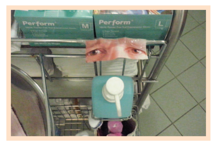
Figure 5: Picture of male eyes at the alcohol dispenser on the wagon for personal hygiene items

of the entire personal hygiene process. They almost never disinfected their hands after changing the water and clothing and after putting the lotion on the resident, because the procedure followed by hand disinfection was not executed. Furthermore, disinfection of the hands was slightly worse after washing the face, body, back and hands, as the observed were in a hurry during the procedure and often forgot to replace the gloves and dis-