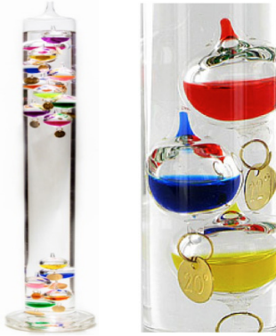
Figure 1. Galileo thermometer.

Each of the floating spheroids displaces a weight of fluid equal to its own weight, while the others either displace too much or too little liquid to float at a specific position within the cylinder. Such a statement derives from Archimedes' principle.