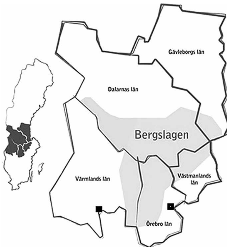
Figure 1: The current geographic shape of the Swedish Bergslagen area

This paper is based on two in-depth interview studies in Sweden: one conducted in 2011 in the county of Örebro and the other conducted in 2014 in the county of Värmland (Figure 1). The residential towns of Karlstad (Värmland county) and Örebro (Örebro county) are indicated with black squares. The borders of Bergslagen are based on cultural views rather than administrative divisions. The Bergslagen area stretches over five counties (Swedish: län ), mainly consisting of depopulating post-industrial municipalities.