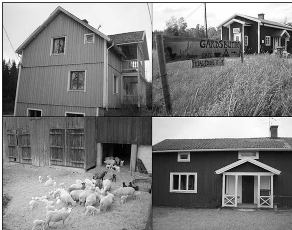
Figure 3: Properties owned by family 9 in Hällefors

Later, family 9 bought a cow together with six other families, as part of a LEADER project, with the aim to render local agriculture more sustainable. This cow lives in the family's barn and is taken care of by the seven families living in neighbouring localities, who also enjoy her milk and cheese. One goal is to slowly increase the number of cows – and perhaps pigs – in the future in order to create a self-sustaining dairy and meat industry. Also, the idea is that local cohesion among these and other families will grow, for instance through monthly meetings or producing cheese together. According to one of the participants, "to have a living cow in the pasture is a symbol of a living countryside" (Nerikes Allehanda 2014: 4).