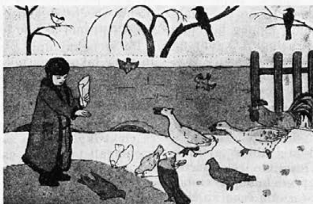
Elica in njeni prijatelji.

Toda Milko ni maral z mamo k štedilniku. Tudi radovednega ščurka ni bilo več tam, polen pa deček tudi ni znosil izpred peči; bal se je najnovejšega neznanca, dasi