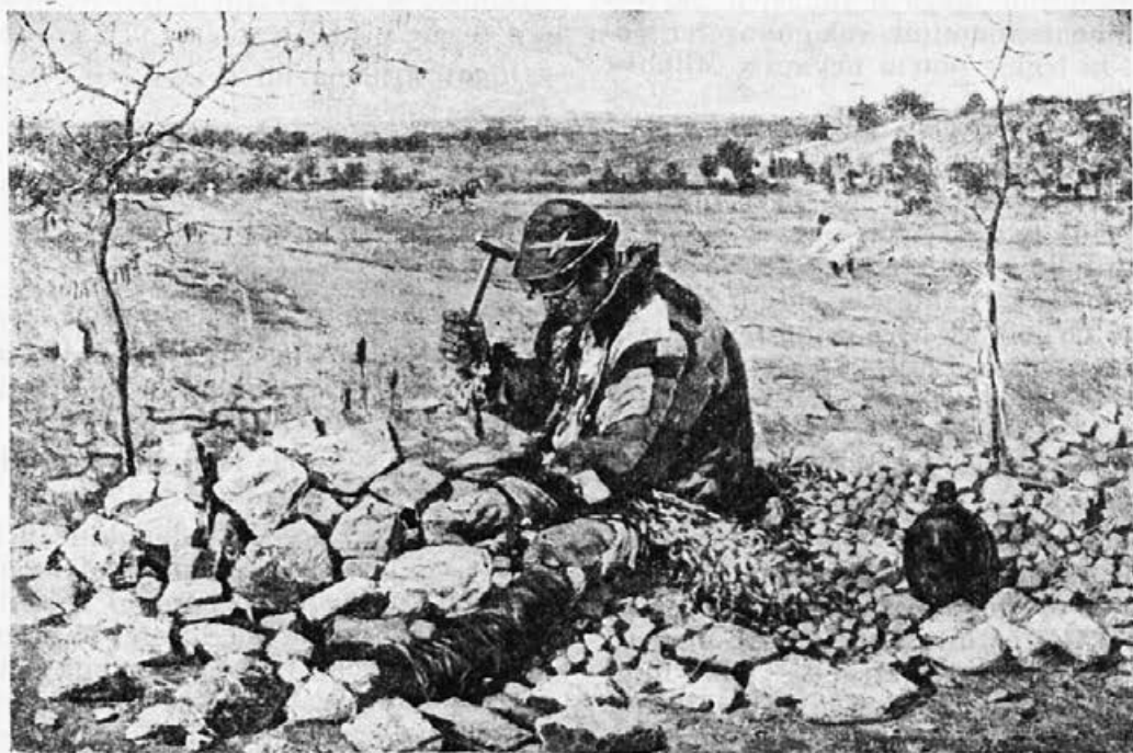
Cigan pri delu.

“Prav ali ne!” je zvenelo v njegovem di-