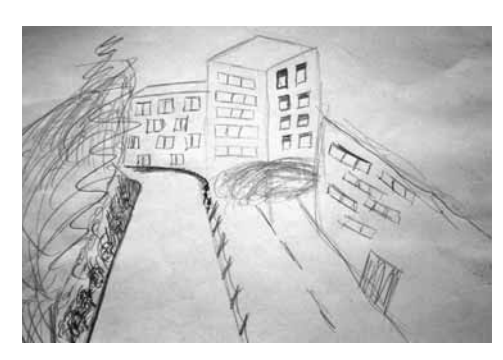
First drawing Dynamic images, very successful

In the control groups the results were as follows: in the group of the pupils regarded as very successful, 65% got higher marks than in the initial testing and 35% got the same; in the group of the pupils that were regarded as successful, 70% got higher marks, 30% got the same marks as in the initial testing; in the group regarded as less successful, 42% got the same marks as in the initial test while 58% got higher marks than in the initial test (Figure 2).