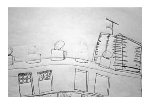
First drawing Static images, successful

Figure 2: Examples of pupils' works from the control group: the first drawing is presented on the left side, the second drawing produced by the same pupil after the use of static didactic means is presented on the right side.