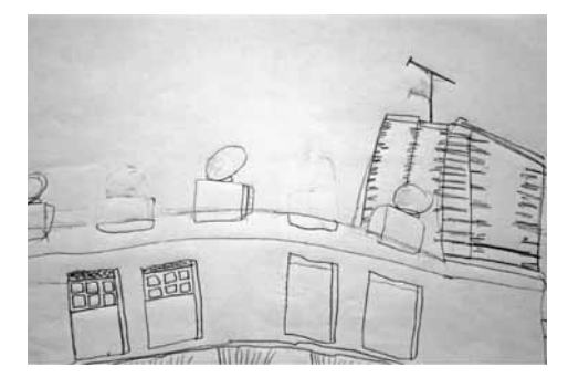
First drawing Static images, less successful