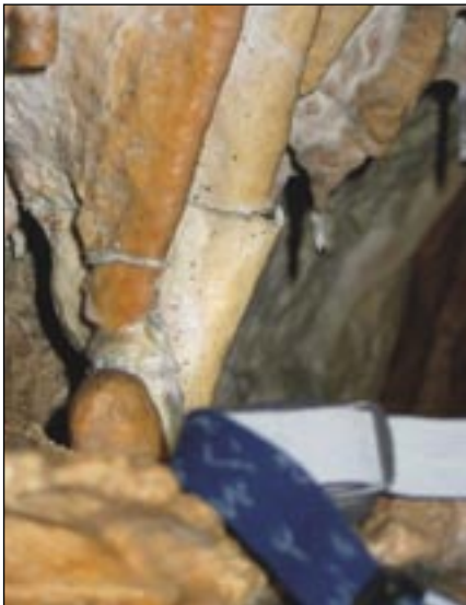
Figure 8: Deformed flowstone in Velika Gora.

Slika 7: Umetni tunel v Postojnski jami in TM 71.