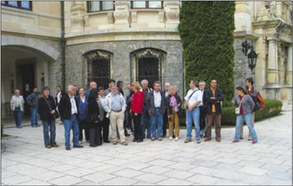
Figure 3: COST 625 participants in Romania, Sinaia. Slika 3: Udeleženci srečanja COST 625 v Romuniji, Sinaia.