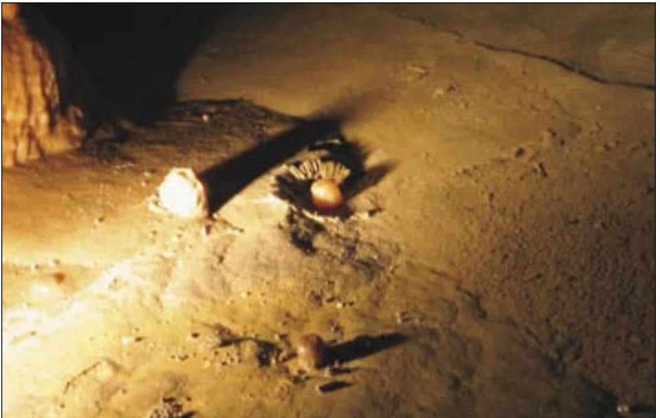
Figure 4: Demänova cave of Liberty. Slika 4: Demänovska jama.