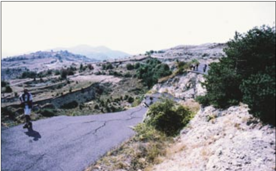
Figure 2: Active landslide in SE Bulgaria. Slika 2: Aktivni plaz v JV Bolgariji.