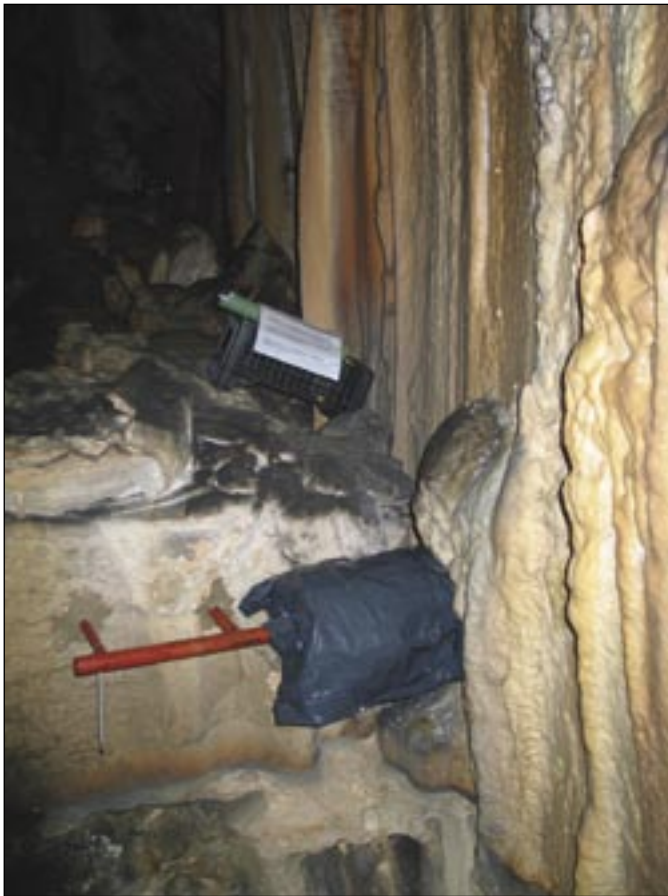
Figure 6: TM 71 and barasol installation in Velika Gora.

Slovenia was active in two Short-term scientific missions COST 625. The representatives of