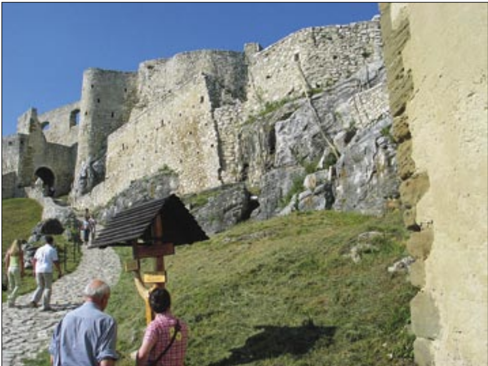
Figure 5: Spiš castle. Slika 5: Spiški grad 71.

In 2005 we visited Demanova Cave of Liberty (Figure 4) in Slovakia. In the cave from August 2001 the TM 71 instrument is installed. The cave was mainly formed in the Middle Triassic limestones. The underground spaces are concentrated along the NNW-SSE oriented faults. The faults are quasi-parallel with an active fault in the Demanova valley (Hók et al. 2000) and are supposed to be responsible for several mm wide freshly opened cracks in several stalagmites. Conditions inside the cave are suitable for precise measurements because of small variations in temperature (from 6-7°C) and relative humidity (from 95-99 %). An interpretation of actual measurements revealed only a very small displacements along the x, y and z axis (0.1 mm per 31 months). Recorded micro-displacements probably reflect the small temperature changes inside rock massif along the fault planes (Petro et al. 2005).