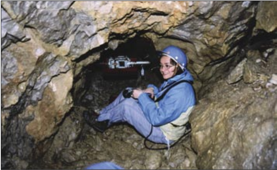
Figure 7: Artificial tunnel in Postojnska Jama and TM 71.

Slika 7: Umetni tunel v Postojnski jami in TM 71.