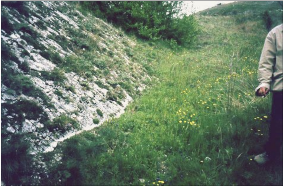
Figure 1: Surface rupture in Italy, Colfiorito. Slika 1: Površinski pretrg v osrednji Italiji, Colfiorito.