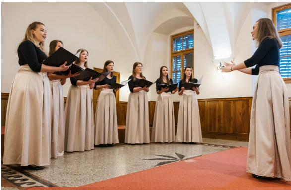
Naše gostovanje v Kanadi so omogočili: