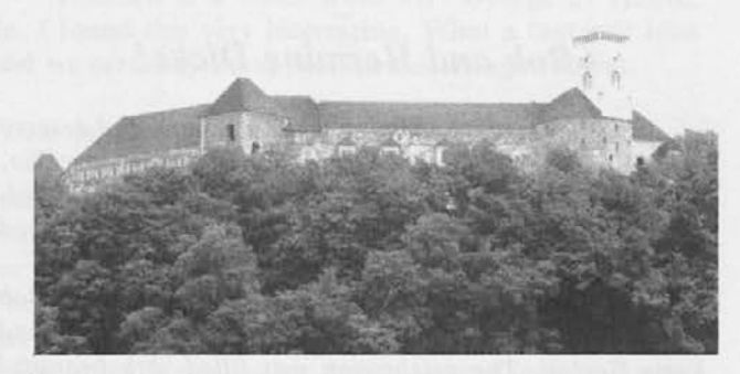
On the Castle Hill rising above Ljubljana, Slovenia's capital, archaeologists have found the remnants of a permanent settlement dating back to around 1200 B.C.

On the Castle Hill rising above Ljubljana, Slovenia's capital, archaeologists have found the remnants of permanent settlement dating back to around 1200 B.C. When Roman soldiers set up a military camp on the left bank of the river in the year 15, there were already buildings existing at the bottom of the hill (today's Gornji trg). In the 6th century, the inhabitants of Roman Emona moved to Istria to escape being attacked by Huns. The new settlement on the Castle Hill dates from the early Middle Ages. The Slavs arrived in the 7th century. In written sources, the town is first mentioned in 1144 as Laibach and in 1146 as Luwigana.