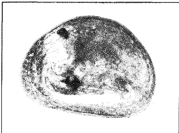
Fig. 2: Cypria ophthalmica (JURINE, 1820) is one of the most common of all ostracods. It was found at a large number of sites throughout Slovenia.

Sl. 2: Cypria ophthalmica (JURINE, 1820) je ena najbolj pogostih vrst dvoklopnikov. V Sloveniji je bila doslej najdena na številnih lokalitetah.