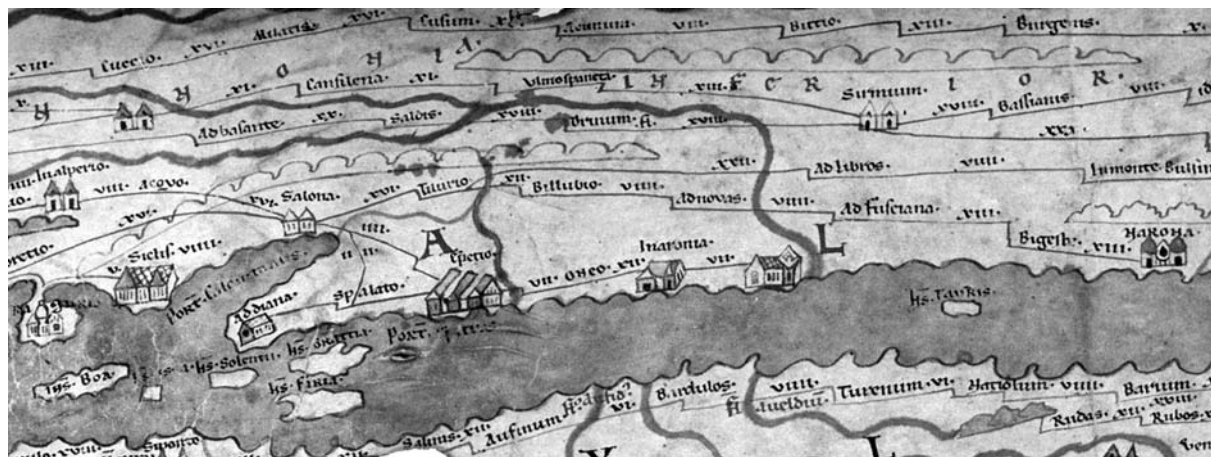
Fig. 1: The Roman road Salona-Inaronia from the Tabula Peutingeriana. Sl. 1: Rimska cesta Salona-Inaronia na Tabuli Peutingeriani.