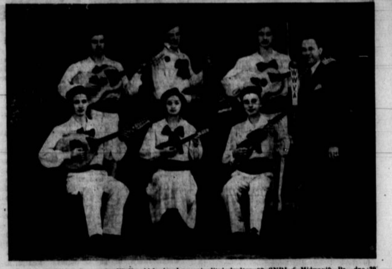
Tamburaški klub v Benwoodu, W. Va., ki bo igral na prireditvi društva 89 SNPJ v Midwayju, Pa., dne 29. maja, to je prihodnji petek. Ta tamburaški klub, čigar mladi člani so vsi člani SNPJ, igra vsako nedeljo pred polnoč od 10:05 do 10:30 na radiopostaji WWVA v Wheelingu, W. Va.