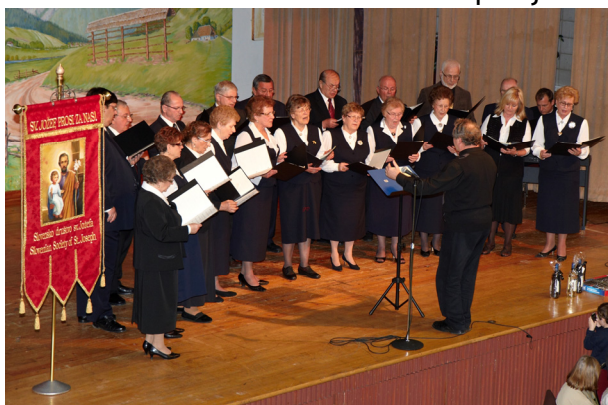
Župnijski mešani pevski zbor