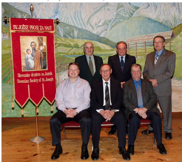
Člani odbora društva St. Jožefa