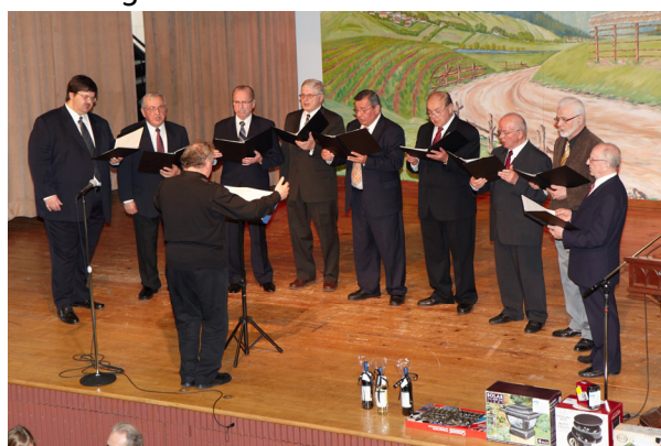
Moški zbor Majolka