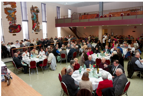
Napolnjena dvorana z gosti