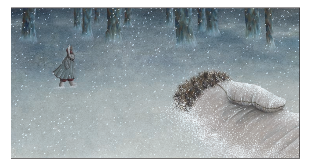
Fig. 2: More than the role of the protagonists, the Ukrainian version of this fairy tale pushes forward the humanistic idea of unconditional inclusivity. The idea of a possible world where everyone who seeks refuge is welcome is supported by illustrator Hana Stupica with dreamy, melancholic images in the background (Rokavička, 2021).

Marjan HORVAT: COGNITIVE MATRICES IN FOLKTALES AND CONTEMPORARY PRACTICES ..., 603-626