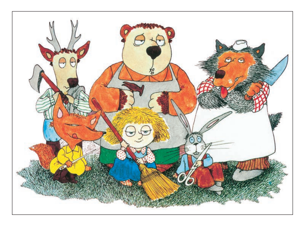
Fig. 1: Characteristic of most contemporary illustrations of the fairy tale Mojca Pokrajculja is the visual characterization of the protagonists. This also applies to Marjan Manček's illustrations, while the artist emphasized the role of the protagonists and, in particular, the unfortunate fate of the rabbit, through their facial expressions (Mojca Pokrajculja, 2022, cover page).

Marjan HORVAT: COGNITIVE MATRICES IN FOLKTALES AND CONTEMPORARY PRACTICES ..., 603-626