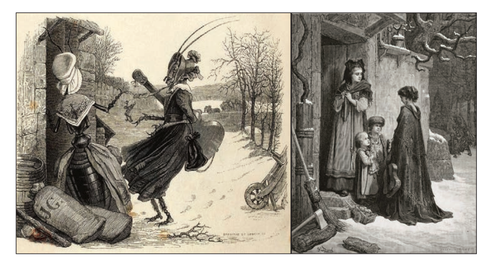
Fig. 3 and fig. 4: The tale The Ant and the Lazy Cricket / Grasshopper, based on Aesop's fable, was depicted by prominent French painters and illustrators from the 18th and 19th centuries. While the illustration (wood engravings), created by J. J. Grandville for the edition of Fables de La Fontaine 1838–1840, with its anthropomorphized images of the ant and the grasshopper, still maintains links with the animal protagonists of the fable (picture 3, left), an illustration created by Gustave Doré around 1880 reflects the transfer of the motif to a social context (picture 4, right).

Marjan HORVAT: COGNITIVE MATRICES IN FOLKTALES AND CONTEMPORARY PRACTICES ..., 603-626