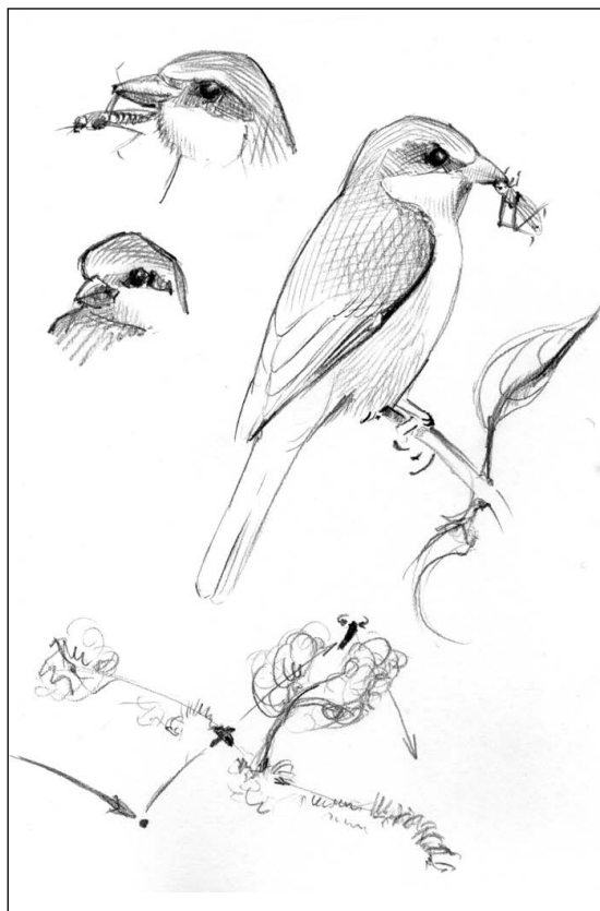
Figure 2: Isabelline Shrike Lanius isabellinus , Slavyanka Mountain, southwest Bulgaria, 24 May 2010 (sketch: A. Ignatov)