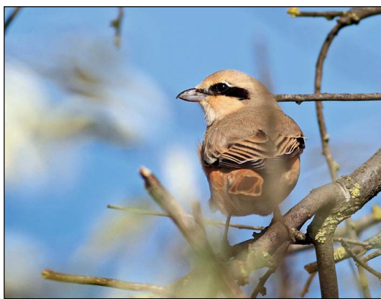
Figure 3: Isabelline Shrike Lanius isabellinus , Durankulak Lake, northeastern Bulgaria, 28 Sep 2014

The bird was identified as a male (Figure 3). It had a typical structure of a shrike. The bill was greyish with dark edges. The supercilium was thin and white to creamy in colour. The mask was black, running from the forehead across the lores to the ear coverts. The primaries were blackish with buff edges. There was a small whitish patch at the base of the primaries, visible as a small speculum. The upperparts were uniformly