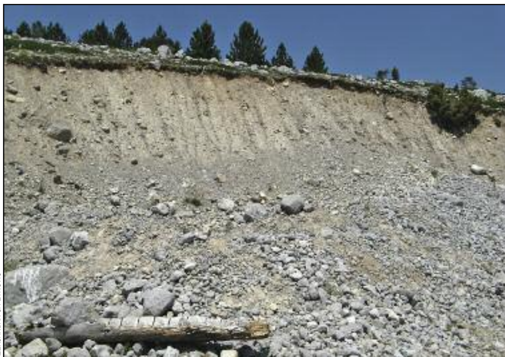
Figure 7: Northern part of the crest at the shepherds' huts in the Kastrat Pasture and the profile through the terminal moraine in the Kastrat Pasture.