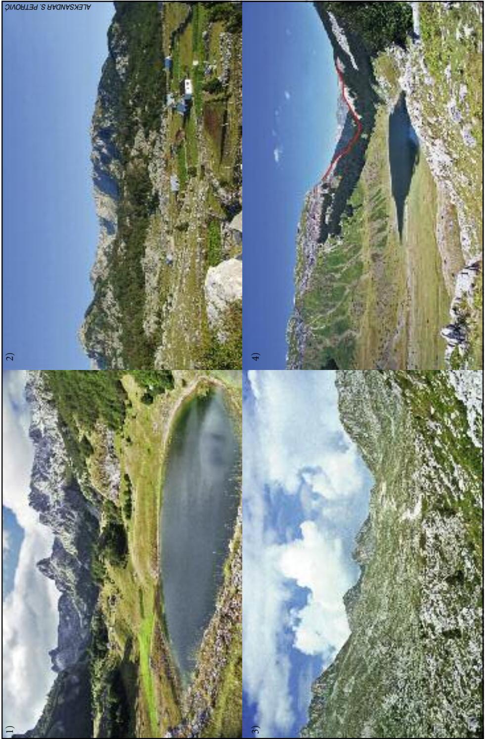
Figure 4: 1) Lake Bukumir, 2) the Žijovo Cirque and part of the Kući Plateau, 3) the eastern part of Mount Žijovo, and 4) Lake Rikavac with the threshold in the background.