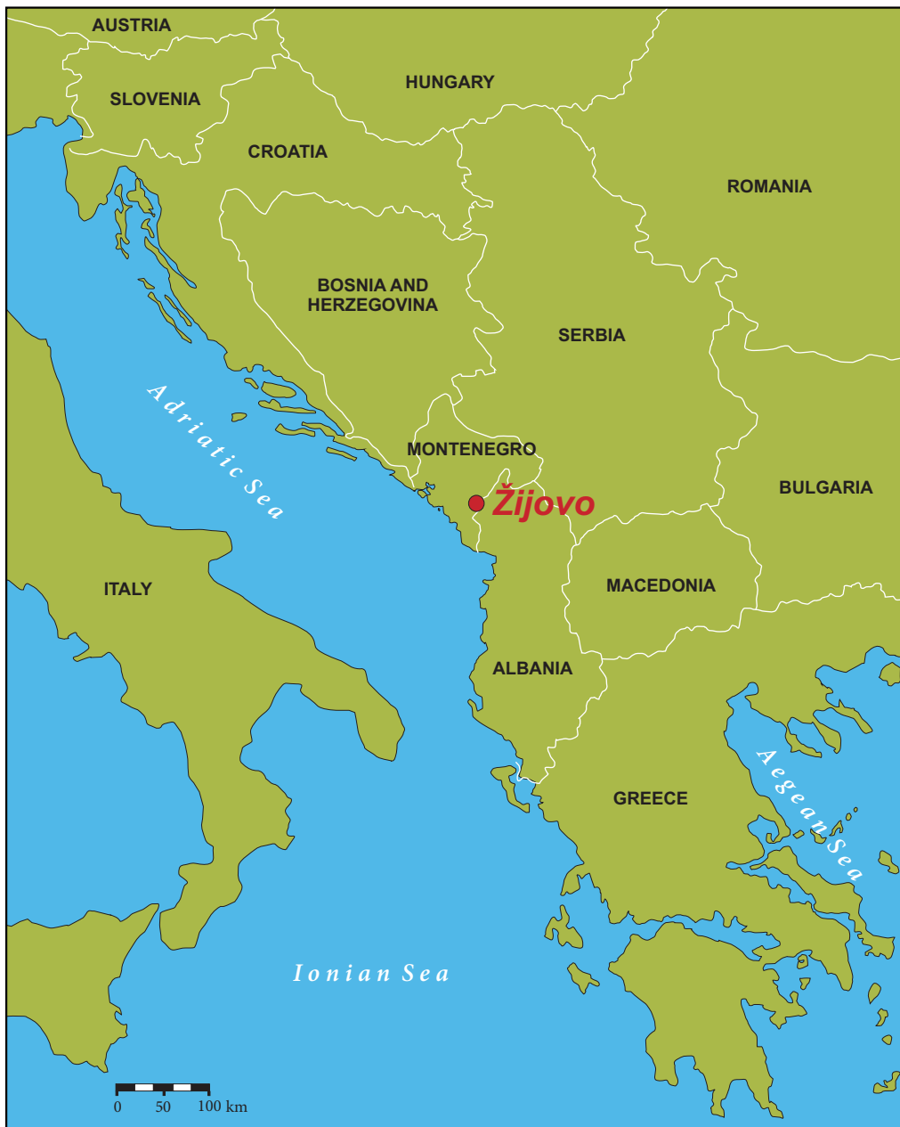
Figure 1: Geographic position of the study area.

The glacial maximum in the Žijovo Range is defined by the lowermost limit of glacial deposits. Flint's glacierization model of »windward growth« (1971) was used to explain glaciation type and the size of glaciation in the Žijovo Range. The main characteristic of this model emphasizes the role of precipitation in the mountain area in glacier growth. This model explains the high mountain glaciation formed in the direction of the main air mass circulation.