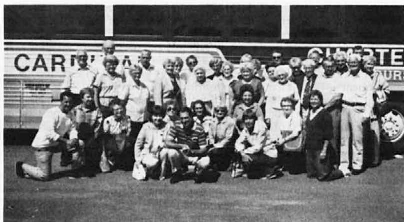
Joliet branch members on the bus trip for Baraga Days.