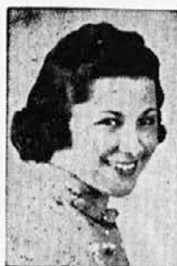
Junior Director and author of a Zarja MONTHLY MESSAGE