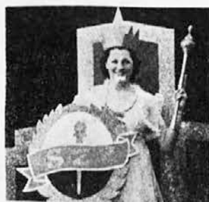
Pageant Queen, Nat'l Convention, 1939