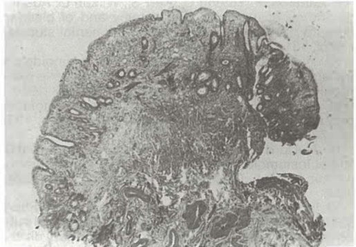
Fig. 3 — A benign polyp of the rectum. Slightly hyperplastic mucosa with proliferation of smooth muscle bundles is seen (HE \times 13).

bundles was not unlike to the case described by Ali et coworkers (1), (Fig. 3).