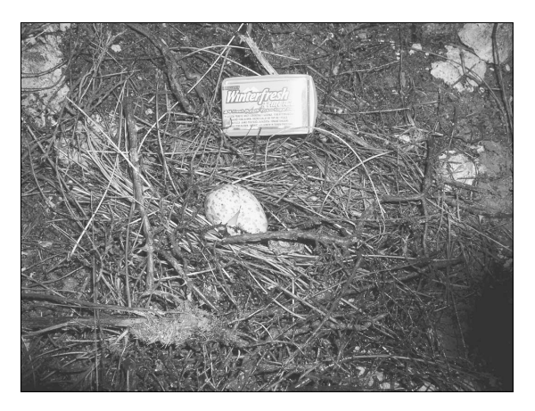
Figure 3: Egg of the Alpine Chough Pyrrhocorax graculus in the Čavkarica hole by the Hotanj spring on Mt. Visočica

Further systematic ornithological surveys would provide a better view of the species' nesting habits, not only on Mts. Vranica and Visočica, but also on other Bosnian mountains, e.g. Bjelašnica, Čvrsnica, Vran, etc.