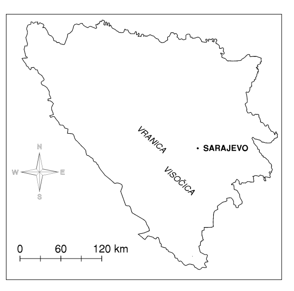
Figure 1: Position of the Mts. Vranica and Visočica in Bosnia and Herzegovina

During the period 2002–2004 we conducted speleological studies on Mts. Vranica and Visočica (Figure 1). We checked the holes as to whether they