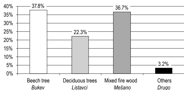
Figure 1: Prevailing tree type among the questioned households using chunkwood

Slika 1: Prevladujoča drevesna vrsta med tistimi anketiranimi gospodinjstvi, ki kot kurivo uporabljajo polena