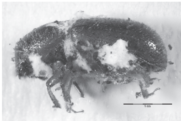
Figure 1. Dried bark beetle Dryocoetes autographus with an outgrowth of fungal mycelia

We determined that the content of isolated fungi differs depending on whether the fungus is isolated from recently dead individuals or long dead individuals. The numbers of individual species of fungi and their species composition was also dependent on the time of sampling of the bark beetles. The predominant fungi found were Hyphomycetes (Pictures 1, 2).