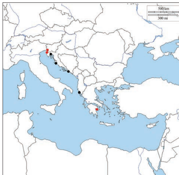
Fig. 1: Updated distribution of Gobius bucchichi ; black circles indicate published records; red circles indicate new distributional records from Italy (Adriatic Sea), Slovenia (Adriatic Sea), and Greece (Aegean Sea).

Data were collected in summer during the period 2017–2019 in snorkeling surveys (with a duration of about 1.5 hour per survey) performed within the bathymetric range of 0–4 m at different locations of the Mediterranean Sea (Fig. 1): Piran (Slovenia; Adriatic Sea; 45.51725 N, 13.56823 E) in August 2017, Muggia (Italy, Adriatic Sea; 45.60577 N, 13.72073 E) in August 2018, and Kondyli beach (Greece; Aegean Sea; 37.53090 N, 22.93402 E) in July 2019. In each area we collected data about the abundance of G. bucchichi , the depth range in which the species was present and more abundant, and the habitat and contemporary presence of G. incognitus and any other similar species. Identification was based on the diagnostic characters that are visible in situ and on photographs (Kovačić & Svensen 2018). Gobius bucchichi , G. incognitus and Gobius fallax Sarato, 1889 differ from all other Mediterranean gobies in a lively coloration of the body and head, which is generally light, i.e. , basically white with yellowish, greenish or greyish tones, and displaying longitudinal rows of darker dots. The identification characters for distinguishing G. bucchichi from G. fallax in situ and on photographs