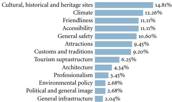
FIGURE 2 Priorities in the destination selection process among English speaking respondents

the sixty-one respondents who have visited Serbia, over half, thirty-eight, have been to the Vojvodina region.