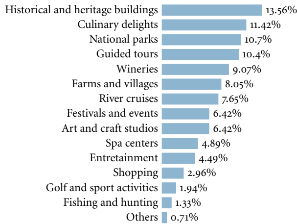
FIGURE 4 Tourism activities respondents would chose for Vojvodina

tourist from respondents' countries. These results are shown in figure 3.