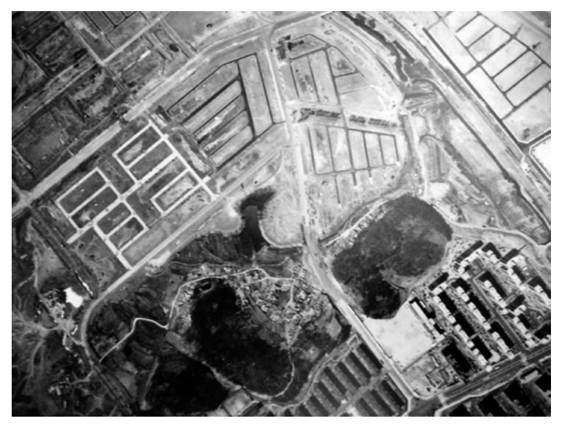
Figure 2: AERIAL PHOTOGRAPH OF POIDONG IN THE FINAL STAGE OF GANGNAM'S DEVELOPMENT, CIRCA 1980