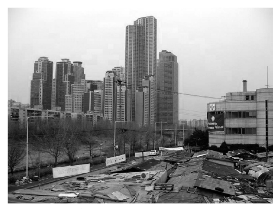
Figure 8: TOWER PALACE OVERLOOKING THE POI VILLAGE SETTLEMENT

While the area around Tower Palace is more prosperous, poverty in the Poi and Guryong villages has ossified. Within the context of an esoteric, high-end culture, the shanty-town residents have been more deprived of their mobility and freedom to communicate. In a homogenised urban environment, the immobile have-nots exist on a lone island that seems destined to disappear. The close proximity of these two polarised spaces reveals the consequence of time – three decades of urban development that has produced a propertied citizenship without sympathy with the urban poor and lacks the will to recognise and resist injustice (Holston, 1998). In the tightly controlled networks of the property market, Tower Palace and the many other fresh high-rise structures demonstrate the domination of rentier capital and mesmerise the public, stoking their unattainable goals of affluence and prestige (Figure 8).