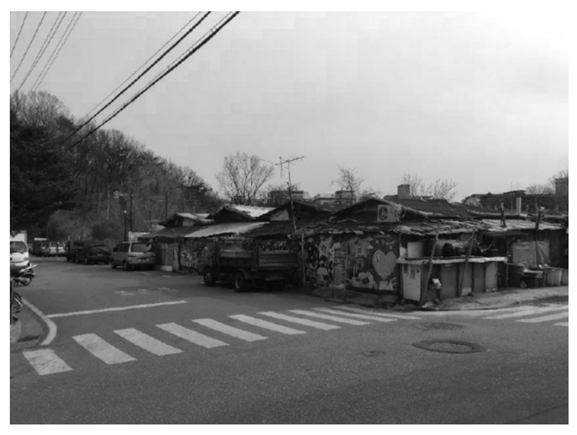
Figure 3: VIEW OF POI VILLAGE, 29 SEPTEMBER 2017

After the Seoul Olympics, the area surrounding Poi Village was also no longer devoid of any urban infrastructure. Along with the transformation brought by the construction of modernist apartments, the life of the Poi Village residents was also challenged by the democratising social milieu ignited by citizen protests in 1987. Within 2 years of the 1987 Democratic Movement, the 'platoons' were finally dissolved and residents of Poi Village were freed from the constant police surveillance and perennial control. Still, freedom came with a price. Without notifying anyone at Poi Village, the city government clandestinely eliminated the old lot numbers of Poi 200-1 and renamed them Poi 266 (Shin, 2011). This meant the current Poi Village settlers living at their old addresses were no longer recognised as legitimate occupants. Removed from the official map, the squatters were soon informed of their illegal occupation. They faced an unstable future whereby their homes could vanish at any time (Figure 3). This realisation ignited a struggle to defend their housing rights and led them to demand they be issued with national residency registration cards (NRRCs). Created in 1968, NRRCs have long acted as the sole proof of all South Koreans' national membership and legal residency, the indispensable item a person needs to carry to prove their domestic identity (Park, 2007). The card must be carried at all times and is often required to complete banking transactions and to board airplanes.