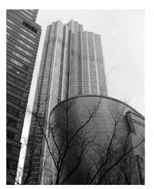
Figure 7: NEW ROUND OF RESIDENTIAL DEVELOPMENT: TOWER PALACE AND THE I-PARK

walking-distance of the shanty towns of the Poi and Guryong villages, Tower Palace, 66 formidable storeys of wealth and power, is visible from all around Gangnam and stands as a gigantic panoptic pylon (perhaps an inverted version) in a sea of property speculation (Figure 7).