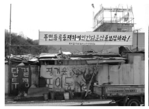
Figure 4: SIGNS OUTSIDE OF POIDONG CALLING FOR THE LOST RESIDENTIAL IDENTITY TO BE REINSTATED AND THE UNFAIR LAND INDEMNIFICATION FINE TO BE ABOLISHED