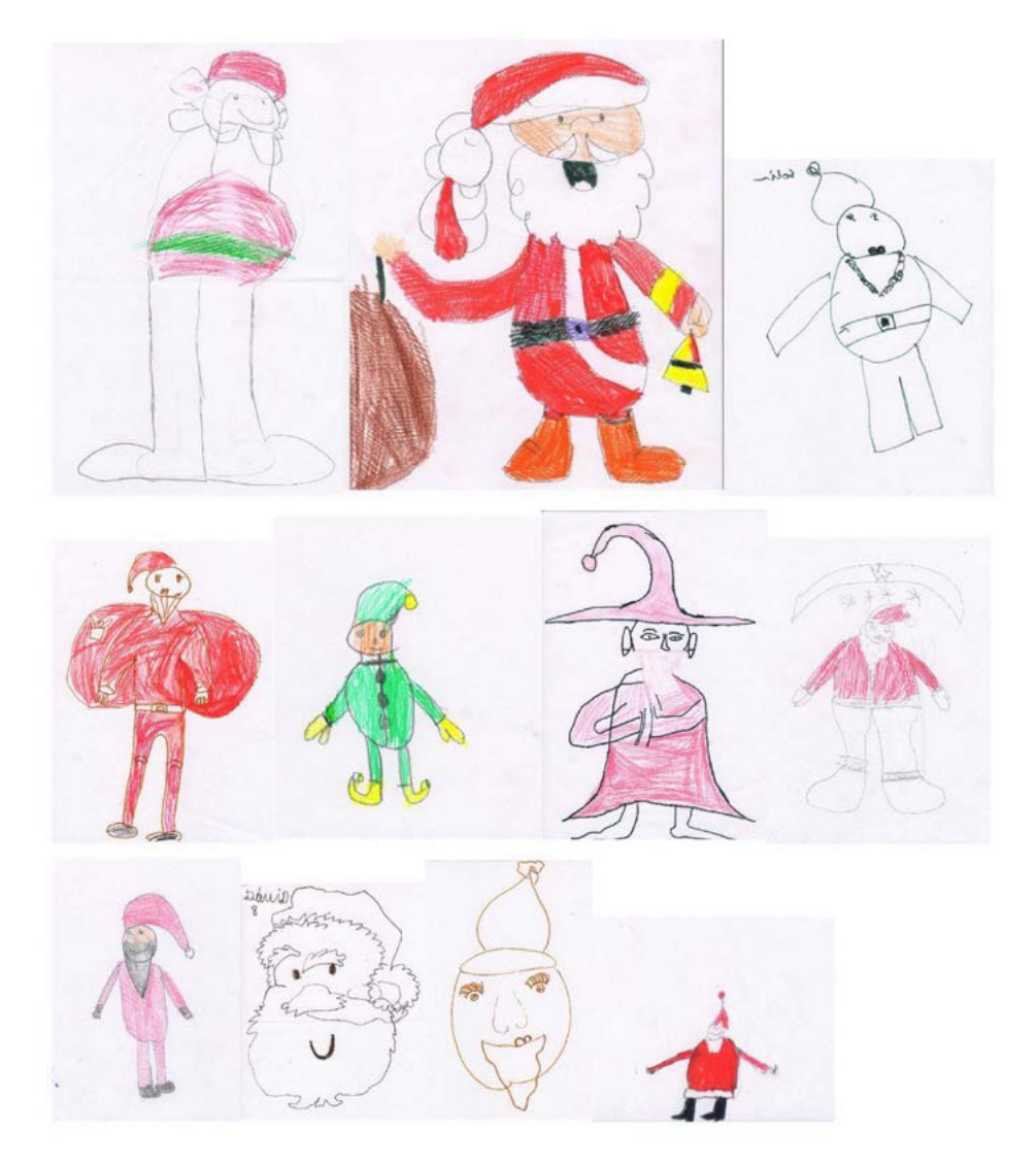
Figure 1: Santa Claus drawings.

timid at first. Even though they knew each other – they were from the same minority community, some even relatives, and many came from the same school classes – the exercise presented new challenges. The first spontaneous drawings were made with playful lines and chaotic scrawls. Sometimes Santa's face was represented with unsure contours and indifferent proportions – for example, eyes only indicated by dots, with missing body parts, such as ears. I asked a girl if she saw this as a problem, and her answer was plain: "Ears are not important, Santa knows everything."