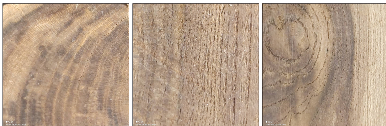
b Cross-section / Prečni prerez