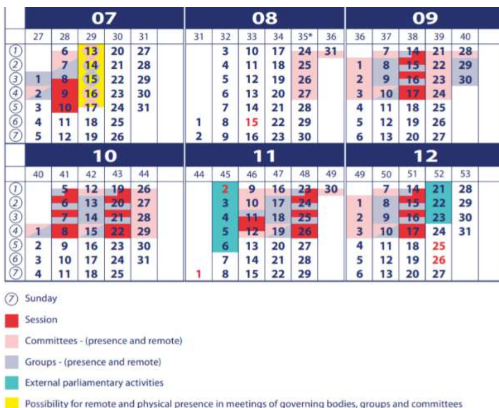
FIGURE 3: NEW PLENARIES FOR 2020

one day) take place in Brussels. However, after the outbreak of COVID-19, the European Parliament had to decide what to do. A decision on the plenary session in Strasbourg planned for March 2020 was first postponed until it became clear that it would be impossible to hold there as normally. First, only the March 2020 session was moved to Brussels, which was presented as a provisional measure, while Quaestor Notice 21/2020 (dated 11 March 2020) set a precedent for the functioning of the European Parliament: plenary meetings in Strasbourg scheduled to take place monthly until September 2020 were cancelled. Instead of Strasbourg, the meetings were moved to Brussels and shortened. The situation was repeated in the autumn/winter of 2020 and continues in the spring of 2021.