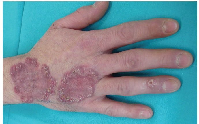
Figure 1 | Fish tank granuloma: polycyclic livid plaques with irregular hyperkeratotic elevated borders and central regression on the back of the right hand and extensor side of the right wrist, and two hyperkeratotic papules on the extensor surface of the fourth and third fingers of the right hand.

Physical examination revealed two polycyclic livid plaques with irregular hyperkeratotic elevated borders and central regression on the back of his right hand and the extensor side of the right wrist, and two hyperkeratotic papules on the extensor surface of the fourth and third fingers of his right hand. The differential diagnoses included superficial and subcutaneous fungal infections, atypical granuloma annulare, tuberculosis verrucosa cutis, verrucous lupus vulgaris, atypical mycobacterial infection, and vegetative pyoderma. Clinical examination did not reveal other skin or mucosal lesions, lymphadenopathy, or associated systemic manifestations. The Mantoux test was negative. Skin biopsies were taken for histopathological examination and culture