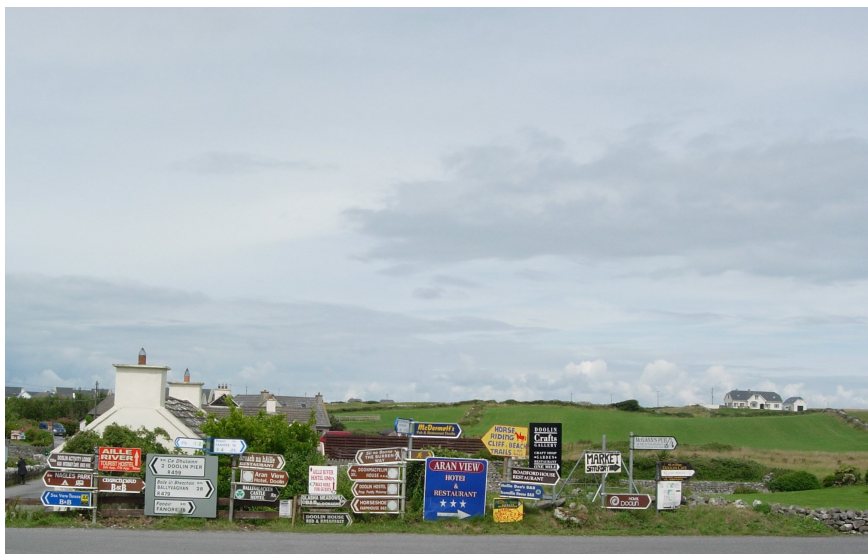
Figure 4: “Moving is like a cross-examination”, photo, Ireland 2010; © Thomas Hochradner.

reflexive relationship with place.” 14 Apparently, criteria belonging to ideals and changes in knowledge, mentality and consciousness have been reduced to mere accompaniments of “place”. Instead, in my opinion, these criteria serve as dominant pillars of every concept and must be considered invaluable. It is because of this that a network in musicological research is secured, which is precisely what the insight into Beard and Gloag’s collection of key concepts elucidates.