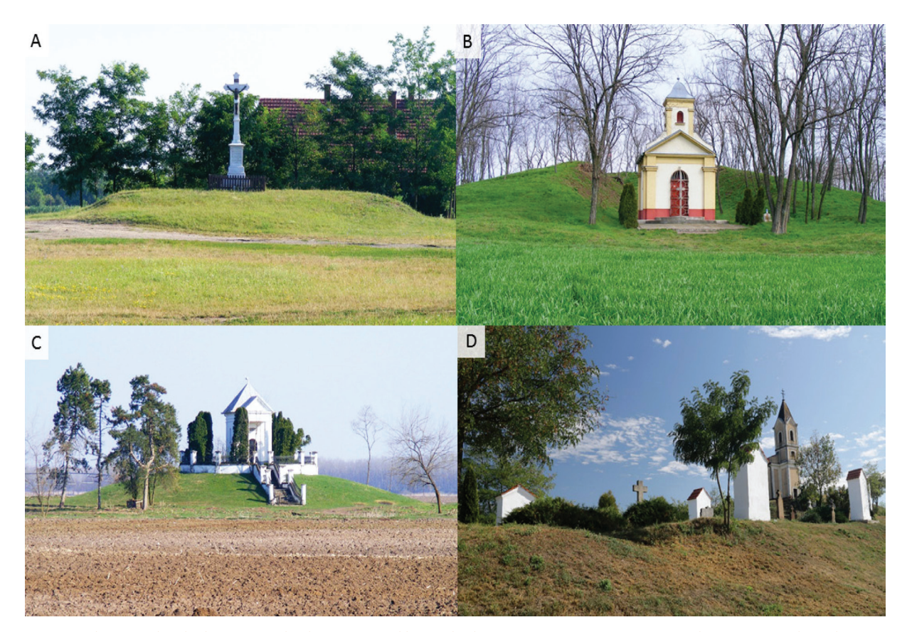
Figure 1: Christian cultural values associated to kurgans covered by grassland vegetation. A – Cross on an anonym kurgan (near to the settlement Szegvár; Hungary); B – Chapel on the Kriptáj-halom kurgan (near to the settlement Dombegyház; Hungary); C – Chapel on the Torda-halom kurgan (near to the settlement Szeghalom; Hungary); D – Stations of the cross on the Kálvária-halom kurgan (Tiszaörs; Hungary).

Slika 1: Krščanske kulturne vrednosti, povezane z gomilami, in prekrite s travniško vegetacijo. A – Križ na neznani gomili (v bližini naselja Szegvár; Madžarska); B – Kapelica na gomili Kriptáj-halom (v bližini naselja Dombegyház; Madžarska); C – Kapelica na gomili Torda-halom (v bližini naselja Szeghalom; Madžarska); D – Postaje križevega pota na gomili Kálvária-halom (Tiszaörs; Madžarska).