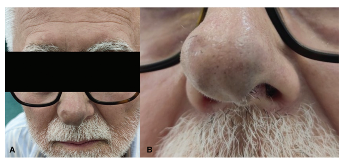
Figure 1 | A) Slightly infiltrated irregularly shaped violaceous-brown hyperpigmented patch on the tip of the nose with discrete central atrophy; B) close-up view of the legion

Based on the clinical presentation, seasonal variations, and histopathological findings, a diagnosis of pigmented ALP was made. The patient was treated with topical 0.1% mometasone furoate ointment twice daily for 2 weeks, followed by 1% pime-crolimus cream and 0.05% tretinoin cream applied in the morning and evening, respectively. The patient was instructed to use topical sunscreens and to strictly avoid sun exposure. Three months after starting the treatment, there was significant improvement in terms of infiltration and pigmentation (Fig. 3A). At the last visit, 6 months after starting the treatment, mild hyperpigmentation persisted (Fig. 3B). Given that our patient responded positively to the prescribed treatment combination, with regression of the infiltration as well as less hyperpigmentation, we continued the therapy with rigorous photoprotection.