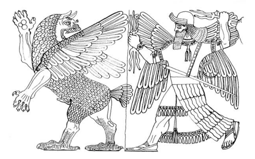
Figure 1: Ninurta as the Sumerian warrior Storm God expelling the serpent-like eagle Zu, a relief in the temple consecrated to Ninurta, Kalah, around 870 BC (Uehlinger 1995:91)<sup>7</sup>