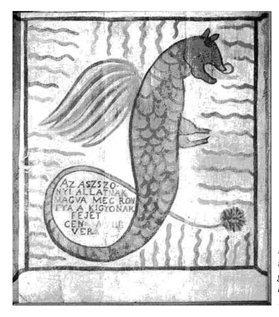
Figure 3: Painting of a dragon-snake on the panelled ceiling of the Reformed Church at Csengersima (Hungary) (adopted from the book: Tekla Dömötör: Hungarian Folk Beliefs. Budapest, 1985)

Čakovec pozoj what is in question is a weak myth, which Barthes denotes in relation to a strong myth. Namely, in the former the political quantum is immediate and the depolitisation is abrupt, and in the latter, "the political quality of the object has faded like a colour, but the slightest thing can bring back its strength brutally" (Barthes 1972:143-144). Needless to say, the slightest things, trifles, are not at all unimportant<sup>54</sup>